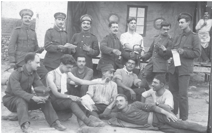
Novelist Stratis Myrivilis at an army camp during the Greek-Turkish War of 1919–1922.