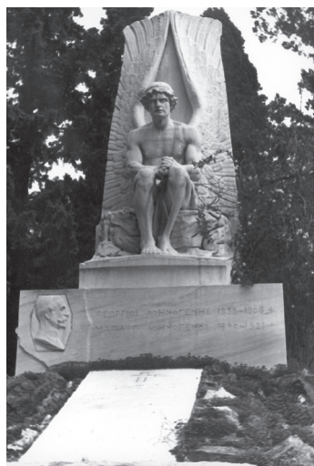
Grave stele of the early 20th c. from the First Cemetery of Athens.

A SPECIAL INSERT TO THE NEWSLETTER OF THE AMERICAN SCHOOL OF CLASSICAL STUDIES AT ATHENS