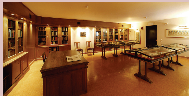
The John B. Mandilas Rare Book Reading Room, set up for a small exhibition for the April 6 event.