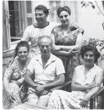
Stratis Myrivilis and his family.

The collection also includes a significant section of transla-