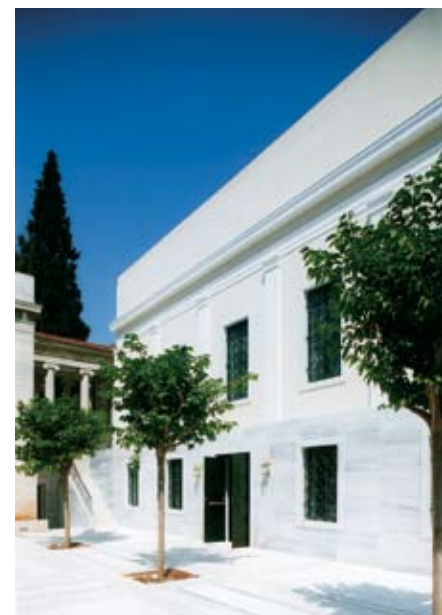
Concept & text: C. Vanderpool Design & layout: M.J. Gavenda

A platform elevator is installed in the stage for raising a piano or heavy equipment to the stage.