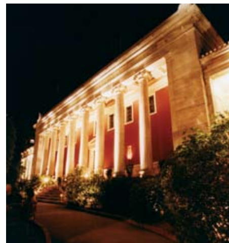
Left to right: Stoa of Attalos Museum and Research Center at the Agora; School's Main Building; The Gennadius Library.