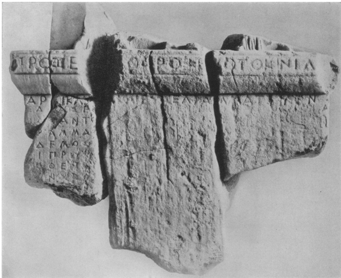
No. 22. Agora Inv. No. I 2806 + I.G., I 2 , 144, frags. d a b

ΣΤΟΙΧ. 27 ἔδ[ο]χσε[ν τῷ βολῇ καὶ τῷ δέμ]οι, Ἄ κα[μ]αντ[ὶς ἐπρυτάνευε, Ἀρχικλῆς ἐ] 5 [γ]ραμμά[τενε, Ἀντικράτες ἐπεστάτ] [ε], Δεμός[τρατος εἶπε· ἐπειδὲ εὖ ποι] εἰ Προχ[σενίδες ἦό, τι ἂν δυνατὸς ἐ] [ι] Ἀθena[ῖος καὶ νῦν καὶ ἐν τῷ πρόσ] [θε]ν χρό[νοι ἐπαινέσαι τε αὐτοῖ κα] 10 [ὶ ἀνα]γρ[άφσαι αὐτὸν ἐστέλει λιθί] [νει πρόχσενον καὶ εὐεργέτην Ἀθε] [ναῖον καὶ καταθῆναι ἐμ πόλει . . .]