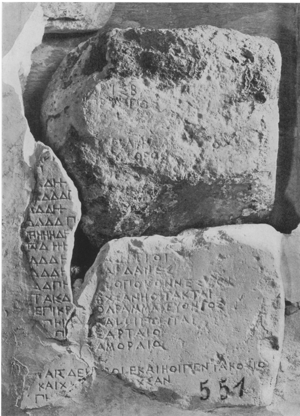
No. 19. Part of the Tribute-Quota List of 430/29 B.C.