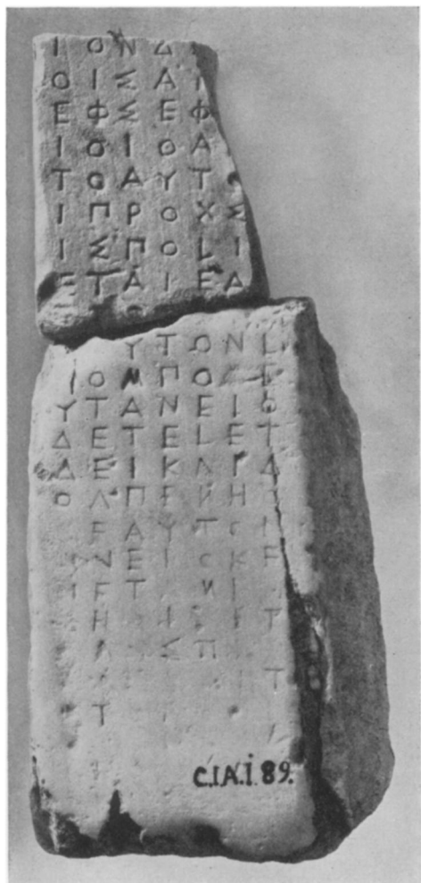
No. 22. I.G. , I 2 , 144, frag. c + I.G. , I 2 , 155

The secretary's name in line 2 seems to be 'Αρχικλῆ[ς] 'Αλαιοῦς. There is no doubt about the name proper, the only irregularity being that the letters kappa and lambda (Ionic) were crowded together; but the demotic has heretofore been read as 'Ωαιοῦς. This form is too short by one letter to fill the available space on the stone, and no trace of the omega can now be read with certainty. On the contrary, just to the left of the supposed omega there seems to be the lower tip of the right diagonal of alpha. With some hesitation, I propose the reading 'Αλαιοῦς. Two examples of the letter Ξ occur in line 1, but they are the only cases of Ionic lettering besides the lambda of line 2. Elsewhere the inscription is written in the Attic alphabet of the fifth century, and some of the letters (particularly nu) seem more archaic even than the date here suggested in 416/5 B.C.