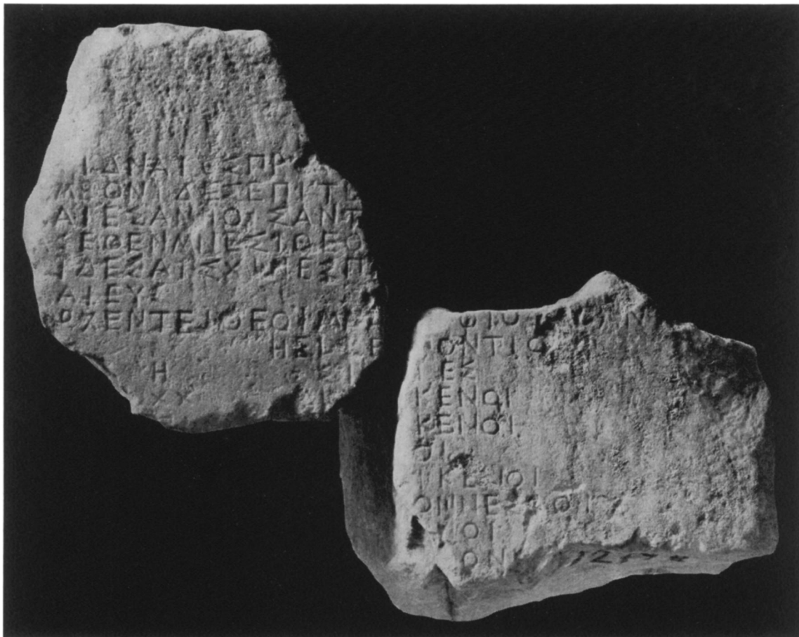
No. 20. Agora Inv. No. I 4809 + E. M. 12798