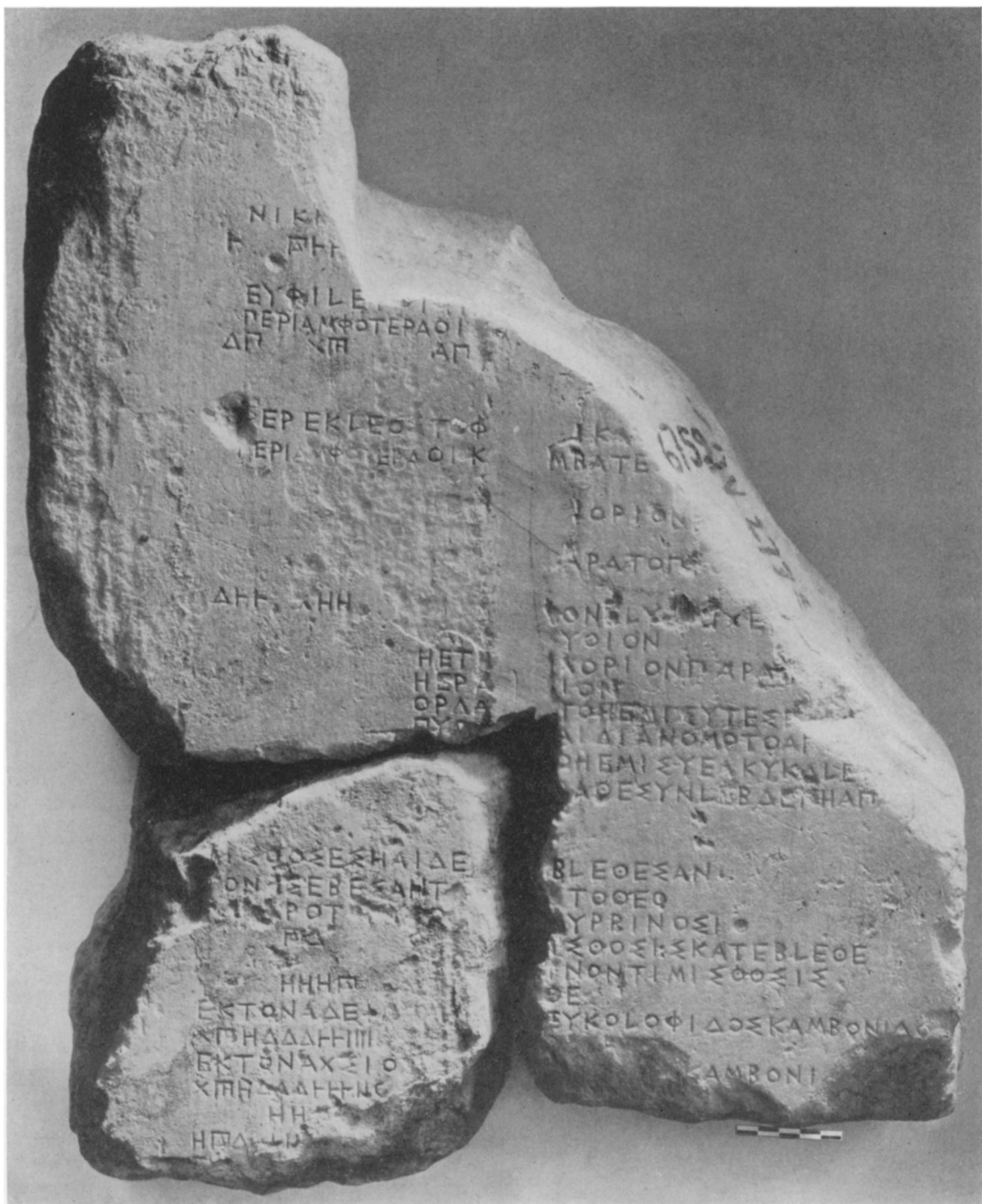
No. 23. Fragments D, E, and F