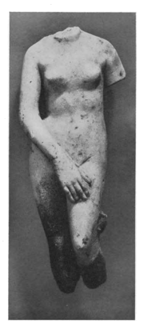
Fig. 3. A Statuette of Aphrodite

The statuette is clearly made after the type of the Aphrodite of Knidos, and in its pose