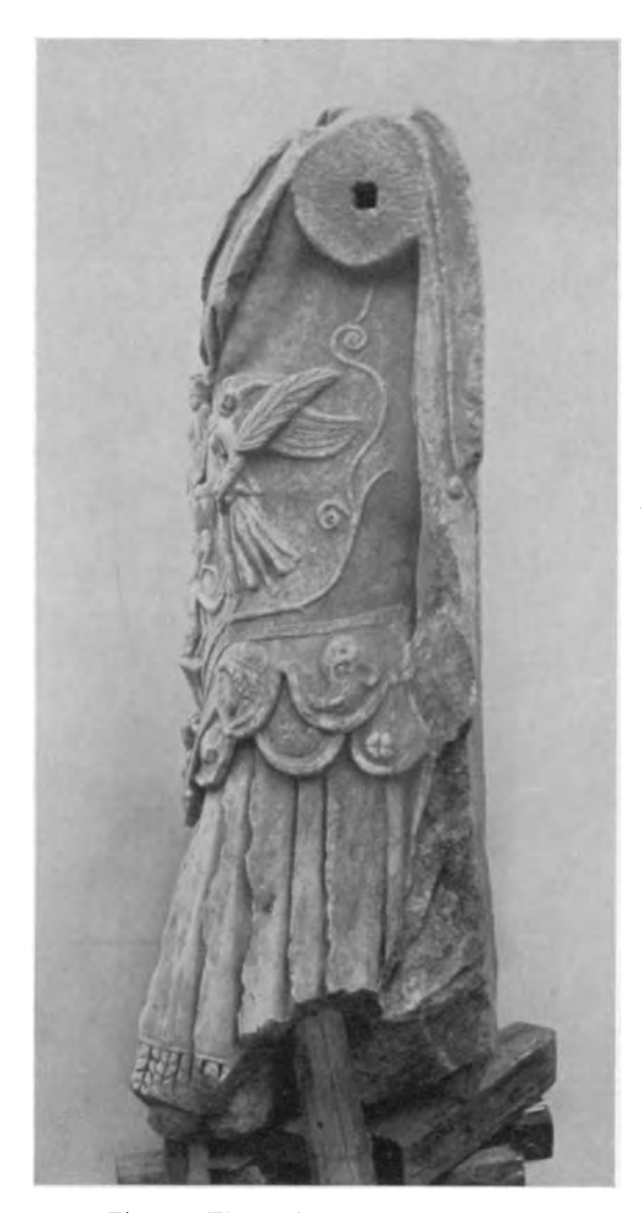
Fig. 9. The Left Side of the Statue

The water-channel in Section E was in process of clearance from the interior when