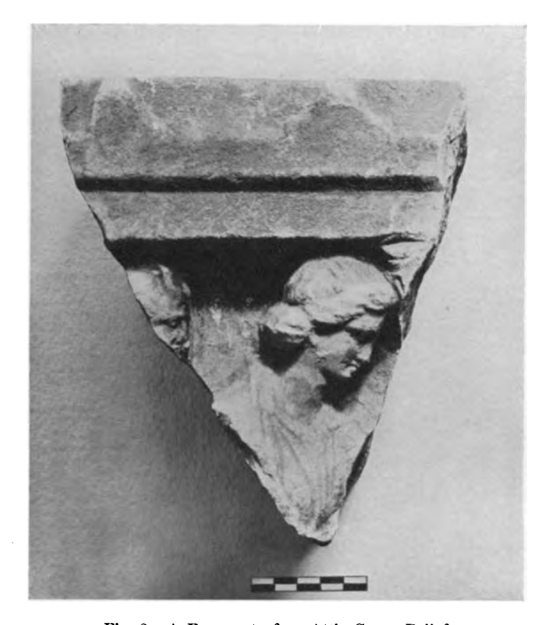
Fig. 2. A Fragment of an Attic Grave Relief

2. A fragment of a relief. Figure 2. Inv. No. 309-S 103. Found on July 13, 1931 in Section E, 10/12T. Height: 0.165 m., width: 0.105 m., thickness: 0.095 m. Pentelic