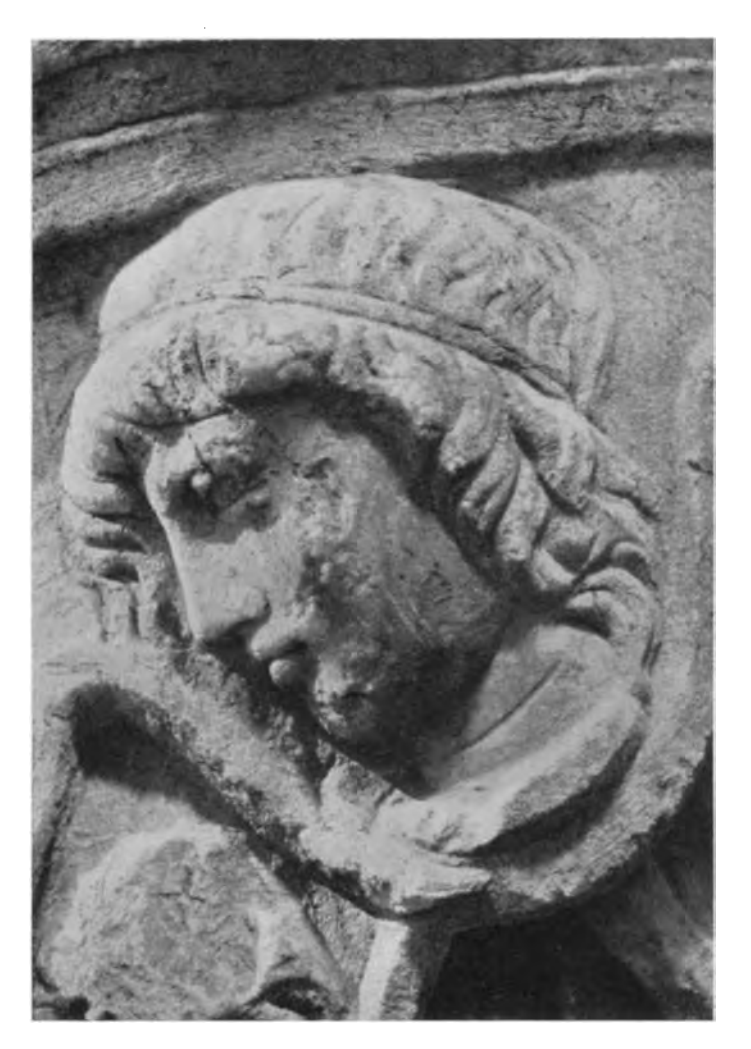
Fig. 10. The Head on a Lappet of the Left Side

eagles with spread wings in an attitude of flight away from the centre, but with the head in each case turned back. Next in order come two heads in high relief represented in full profile, on one side to the right and on the other to the left (Fig. 10). The heads which occur regularly in this position on these statues are usually interpreted as