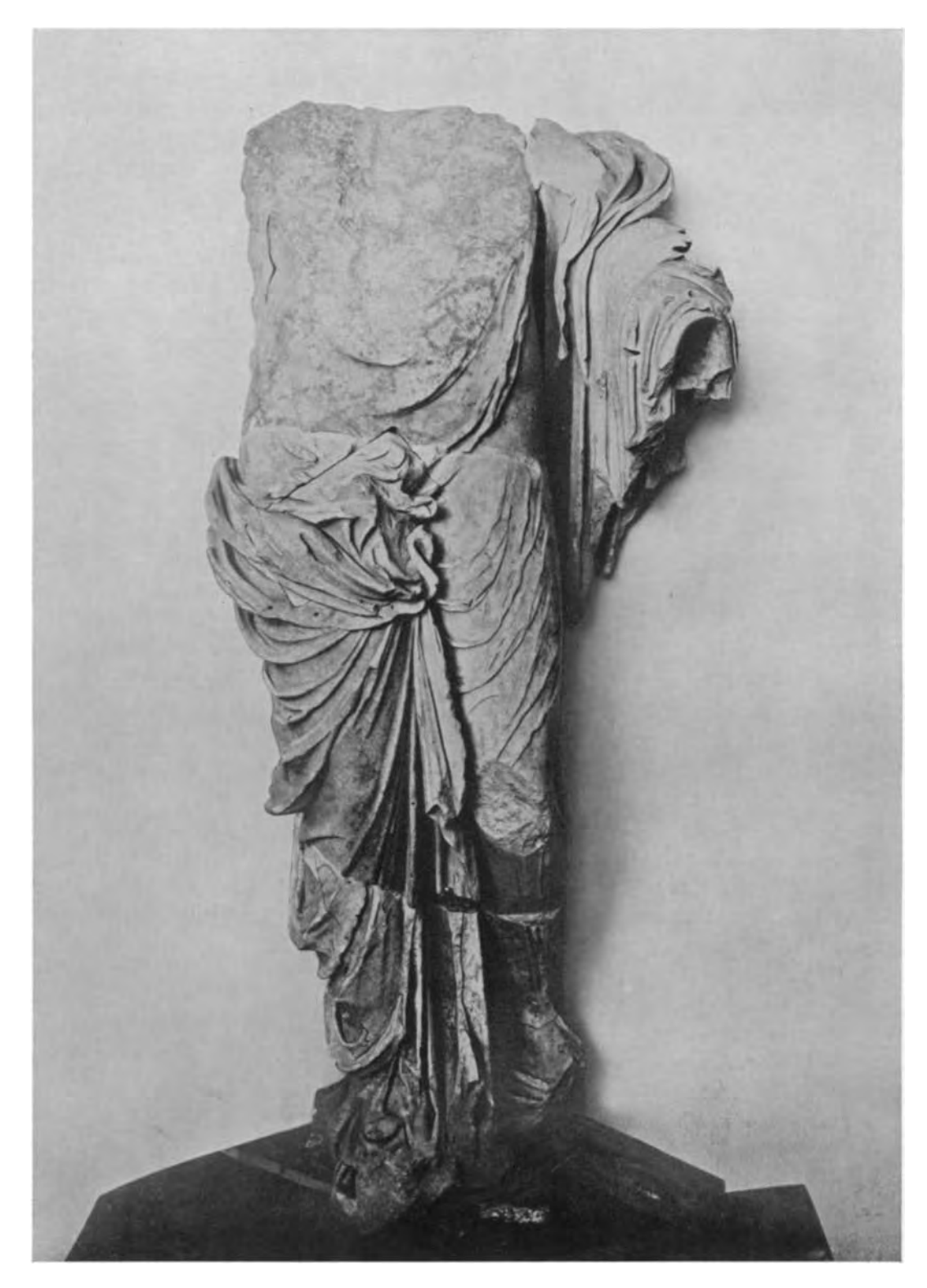
Fig. 5. Marble Statue of a Woman