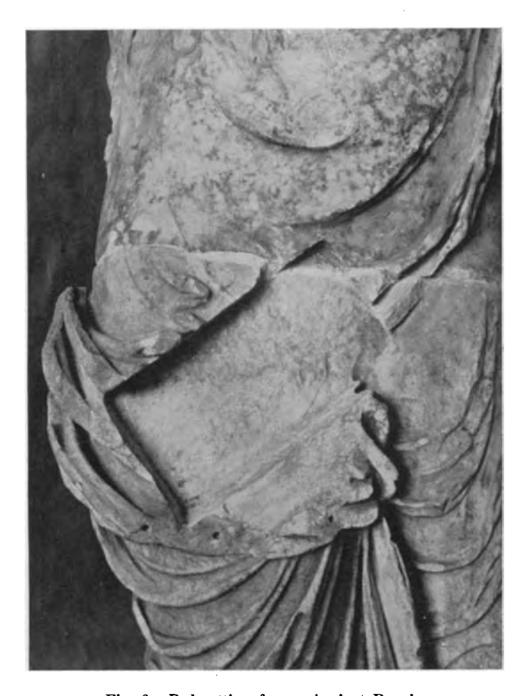
Fig. 6. Bed-cutting for an Ancient Repair

The clothing is represented as of thin texture, and its folds, especially along the left thigh, are depicted with great charm and delicacy. This careful treatment of the