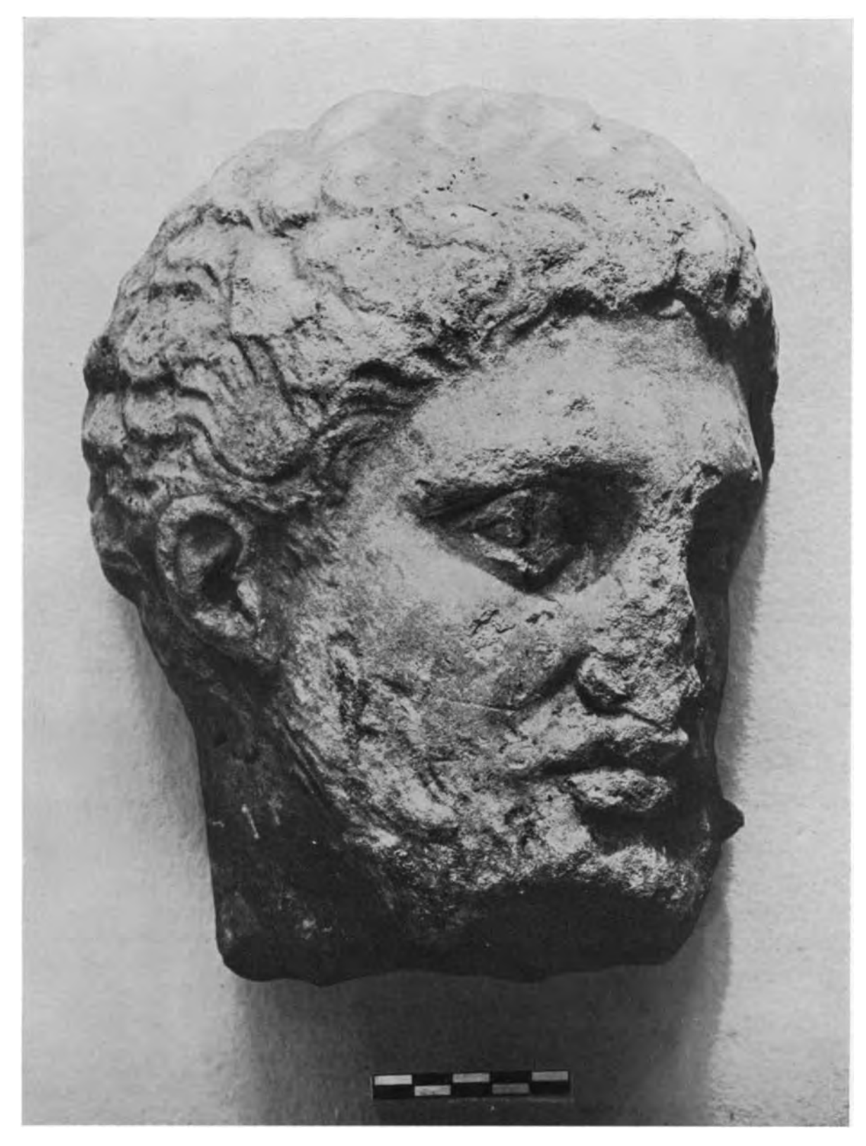
Fig. 1. A Marble Head from an Attic Grave Relief