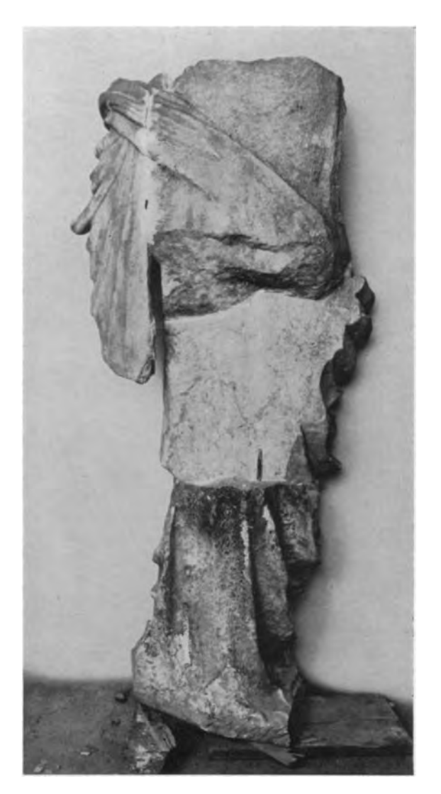
Fig. 7. The Back of the Statue

tänzerin).¹ Also the way in which the mass of drapery hangs down on the left side is matched by the statues in this group which are cited by Lippold, such as the figure in Copenhagen, the Leda in the Villa Albani,² and a Nereid in the Archaeological Museum