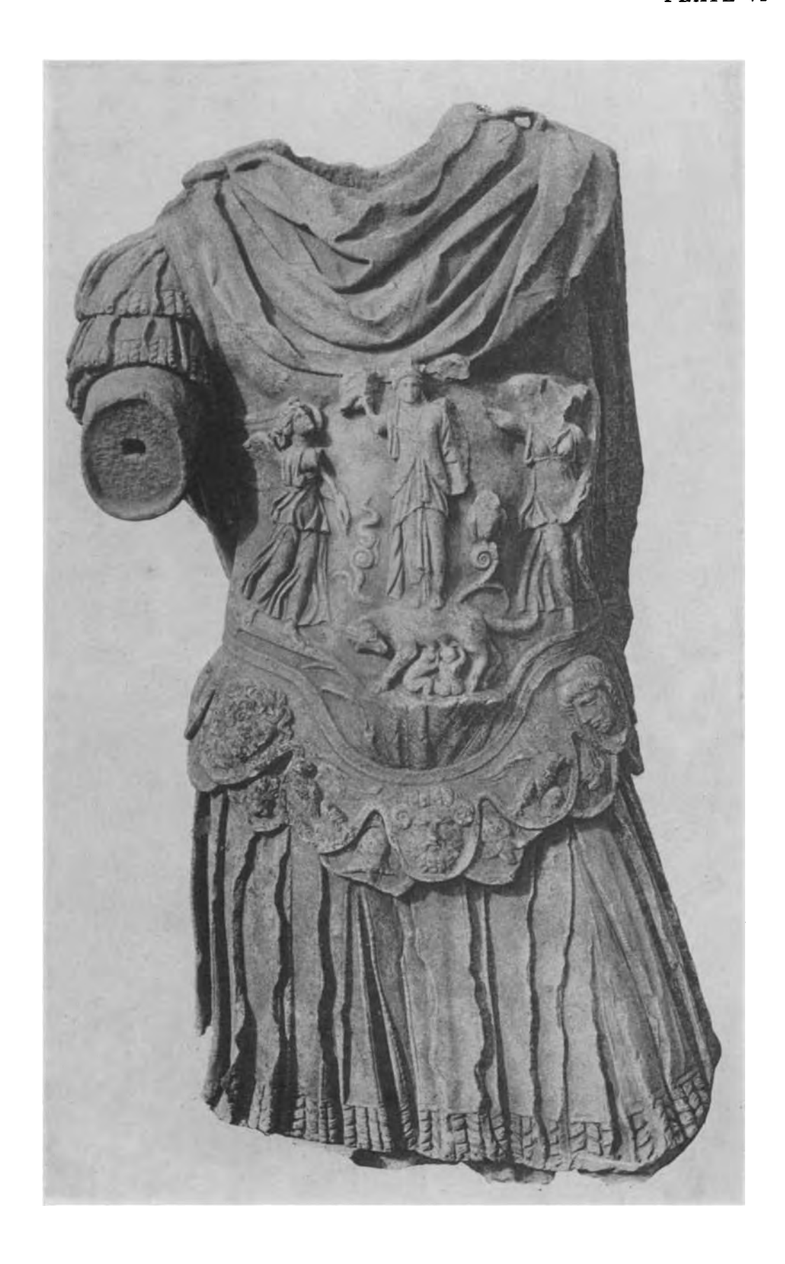
Statue of Hadrian