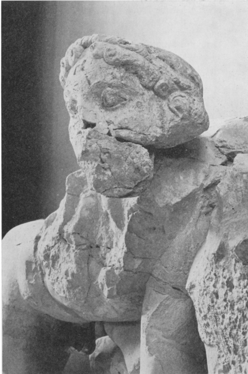
Fig. 5. Head of Herakles, Showing Contact with Torso

that the Herakles head is not looking down but almost straight ahead as if aware of his spectators. The abrupt bending back of the head which this pose necessitates leaves