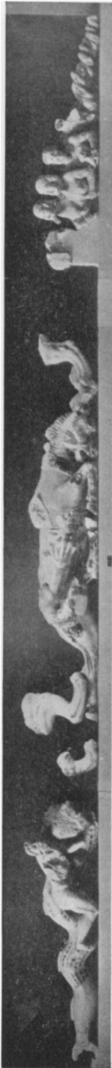
Fig. 6. Poros Pediment, New Arrangement

The old problems concerning the restoration of the pediment and the identity and chronology 1 of the building to which it belonged are not seriously affected by the discovery of the new head. That the Herakles-Triton group is part of the same pediment as the Triple-Bodied Monster is by now universally accepted, and the addition of the new head strengthens this view. Stylistically the Herakles head is very close to the heads from the other side of the pediment, but it differs considerably in details. Hair and beard are different in the two figures, but in the shape of the face, and in the rendering of eyes and mouth the similarity is too strong to be explained merely on the basis of contemporaneity.