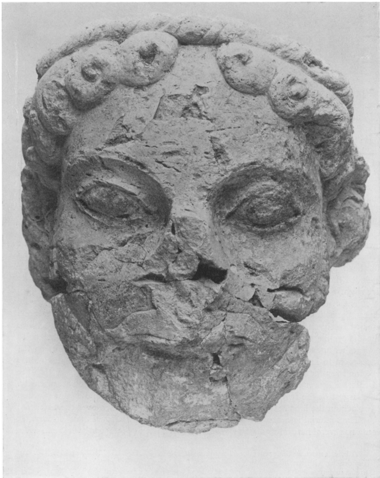
Fig. 1. Head of Herakles, Front View