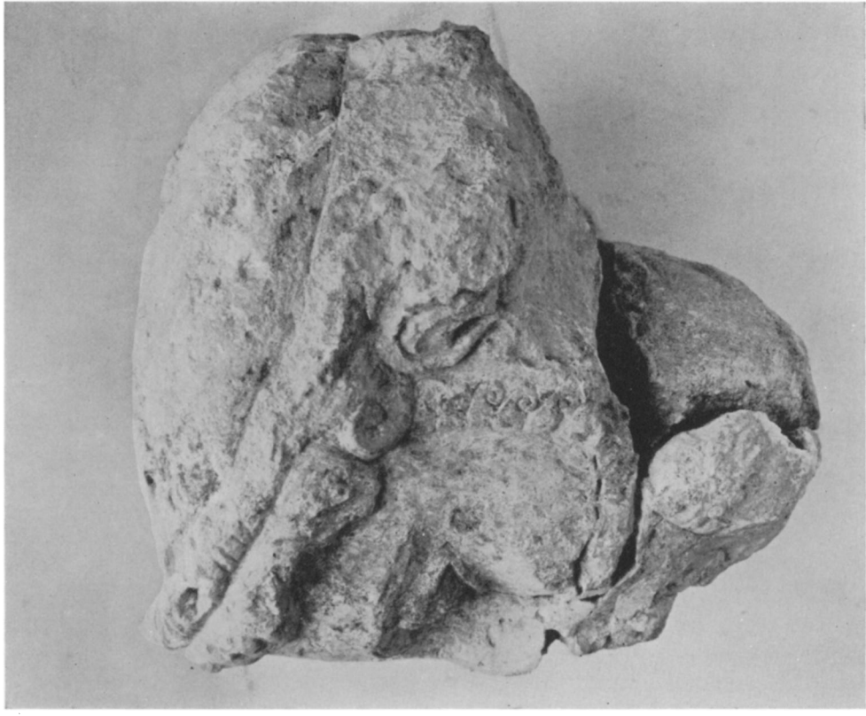
Fig. 3. Head of Herakles, Left Profile