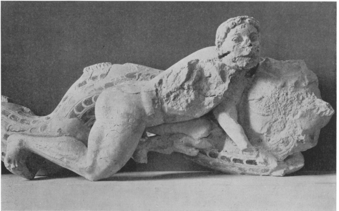
Fig. 4. Figure of Herakles with Head Attached

of Triton in profile, and apparently the missing head of Herakles was similarly turned. But on the larger group there are clear indications to show how the heads ought to be turned. There is obviously no room for the head of Herakles to be shown in full profile looking down, and it could not possibly have been turned so far to his right as to leave room for the head of Triton behind. The collar-bone of Herakles, clearly indicated and well preserved (Figs. 4 and 5), shows that his face was approximately in three-quarter view. The head of Triton on the same evidence must have been turned very slightly toward the spectator's left. 1