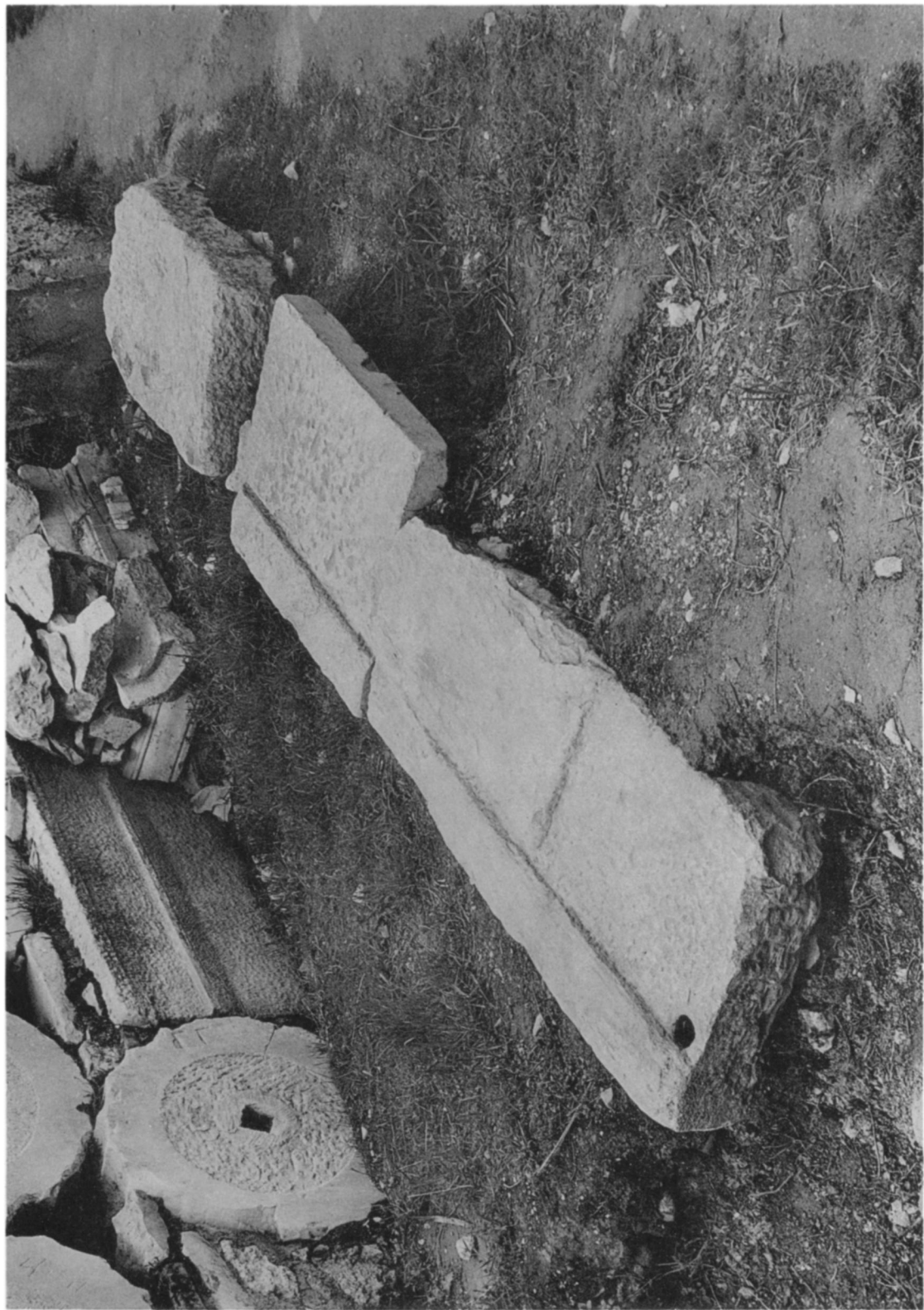
1. Doorsill between the Main Portico of the Library of Pantainos and the Southernmost Room of the Library, viewed from the southeast