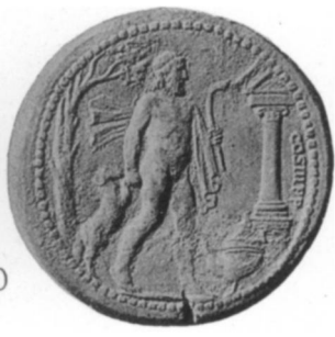
C. SELTMAN: GREEK SCULPTURE AND SOME FESTIVAL COINS