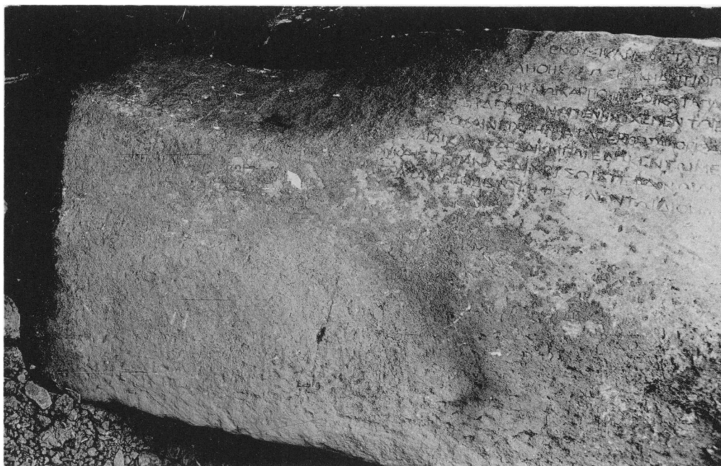
5. The Left Half of the Ikarian Decree (No. 3)