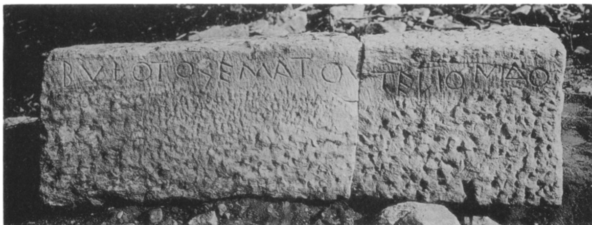
2. The Inscribed Face of No. 1