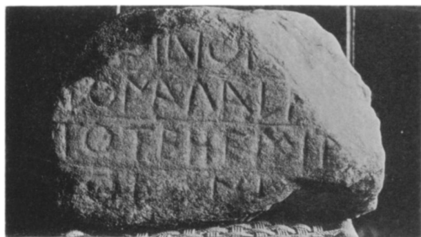
3. Dedicatory Inscription from Ikaria (No. 2)