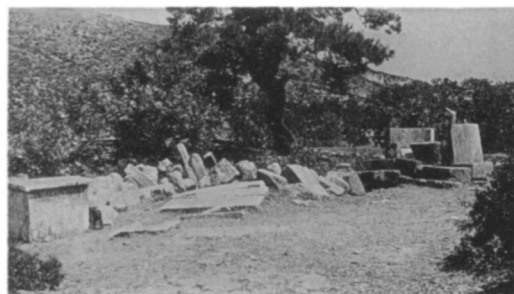
4. Scene of Excavations at Ikaria. The Choregic Monument is at the Right, and the Inscribed Block (No. 3) was Found Near By.