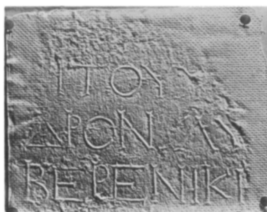
I. G., II 2 , 3899