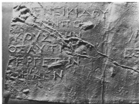
I. G., II 2 , 3513, 1-7