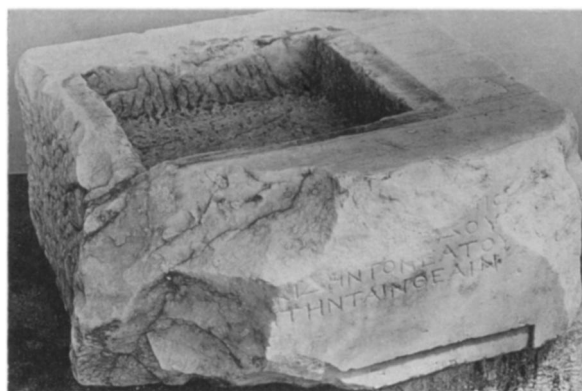
Agora I 5485