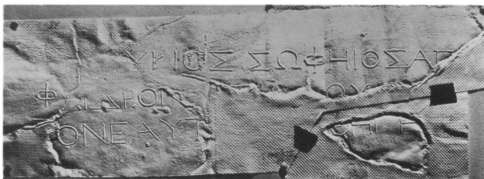
I. G., II 2 , 3897, 7-9