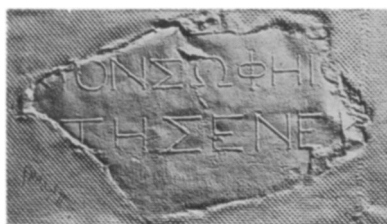
I. G., II 2 , 3897, 1-3