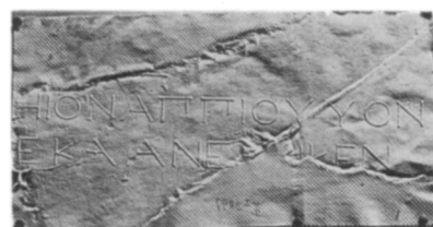
I. G., II 2 , 3897, 4-6