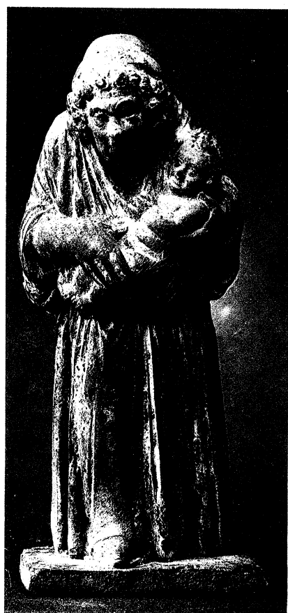
British Museum 1911 4-16 1 (cf. 3)