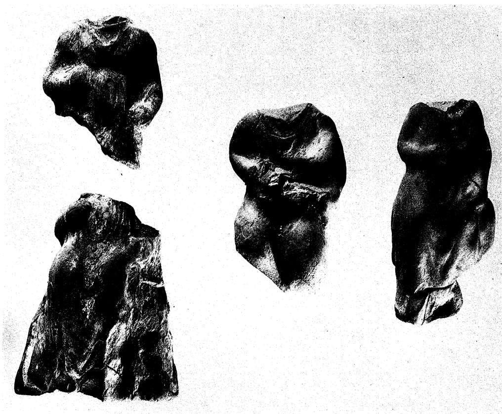
Pnyx (cf. 1, 2)