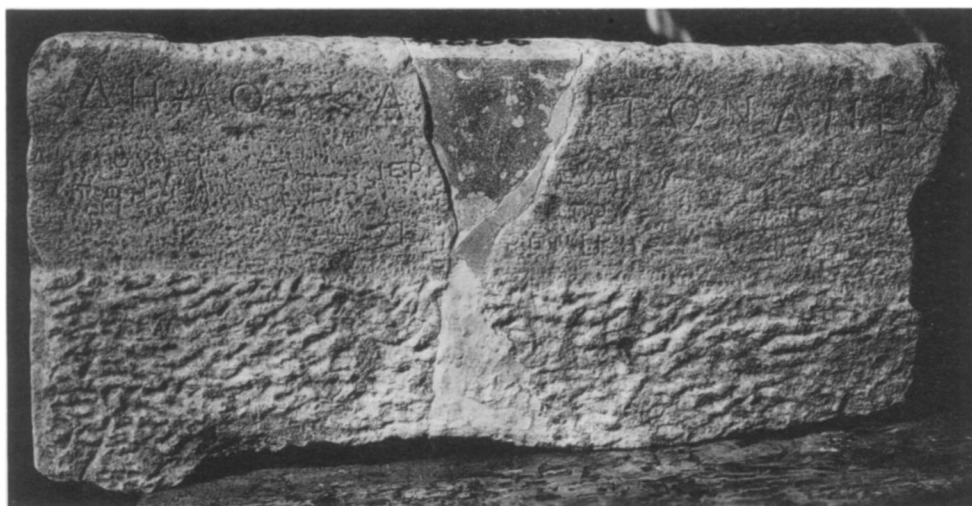
a. I. G. , II 2 , 4676