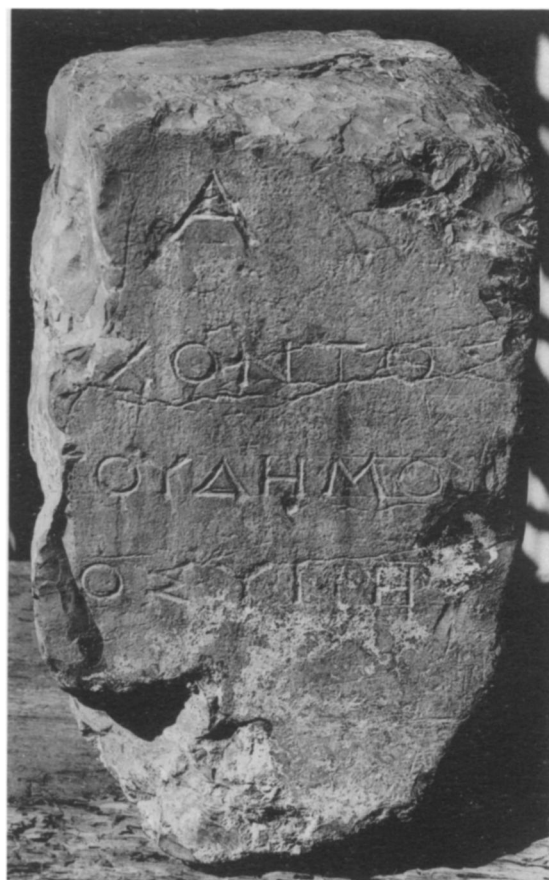
d. E. M. 3913