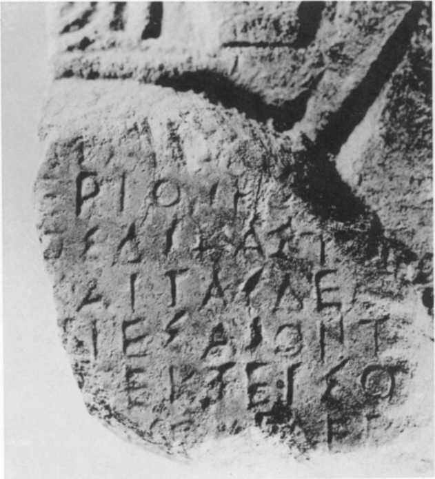
No. 2, Detail