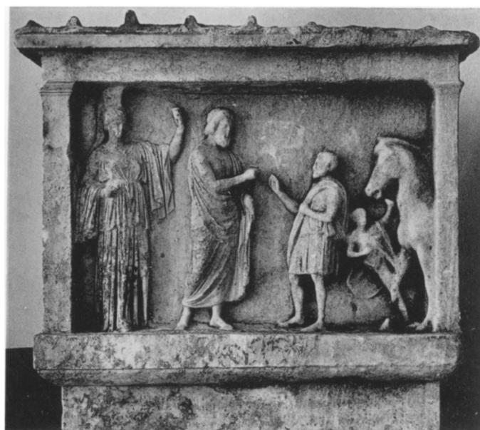
d. I.G. , II 2 , 448

FORDYCE W. MITCHEL: DERKYLOS OF HAGNOS AND THE DATE OF I.G. , II 2 , 1187