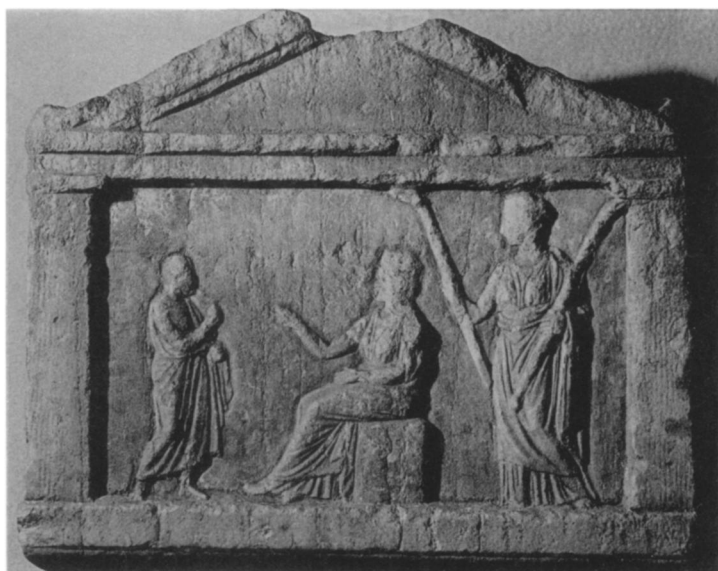
a. I.G. , II 2 , 1187