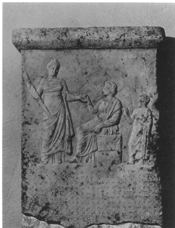
b. I.G. , II 2 , 1193