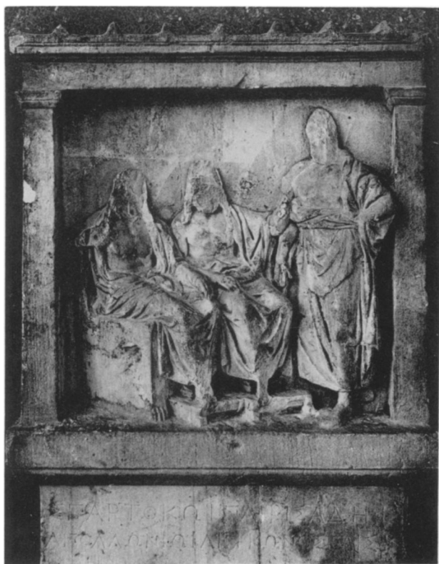
c. I.G. , II 2 , 212