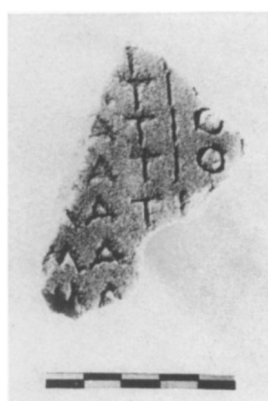
Stele I, fragment j