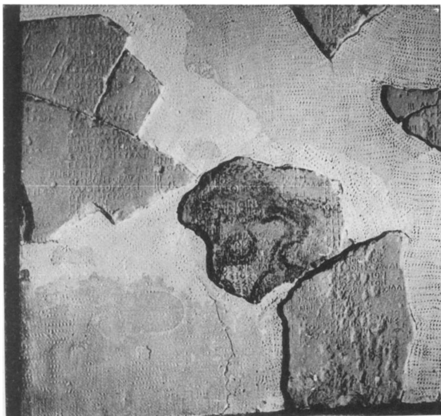
Stele II, fragments b, j and f