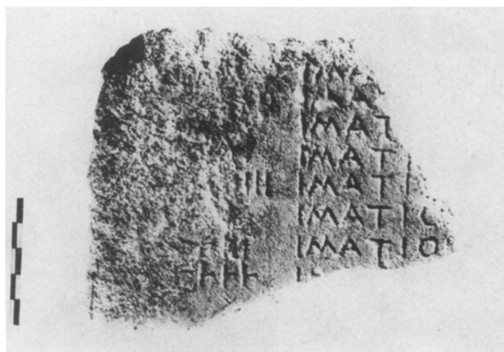
Stele I, fragment i