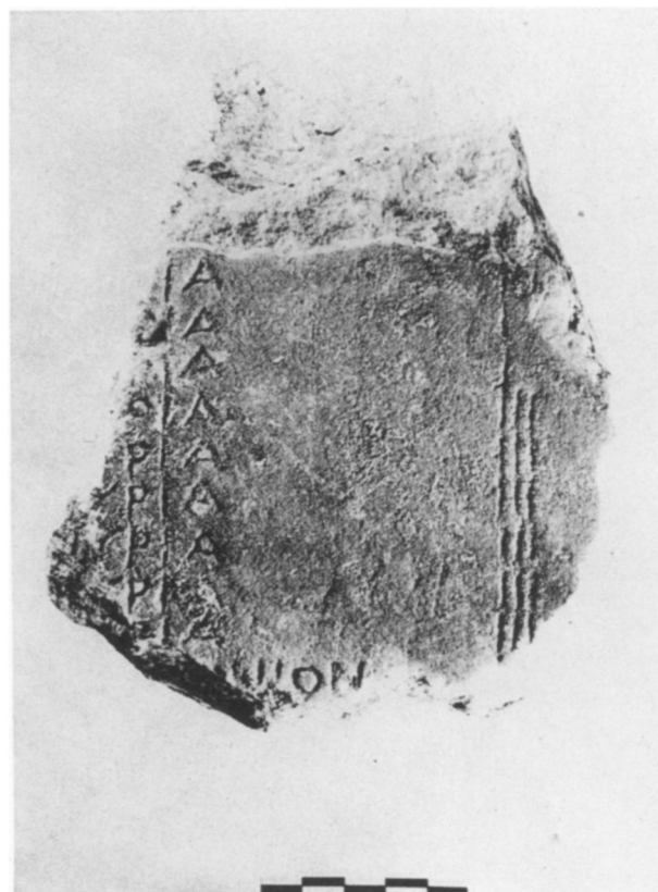
Stele I, fragment k