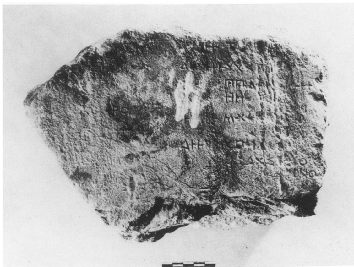
Stele VI, fragment p