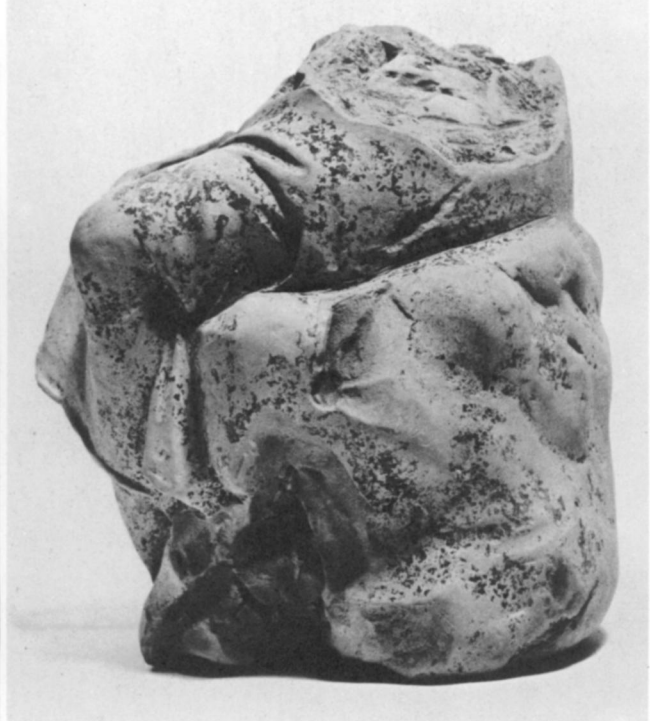
DOROTHY B. THOMPSON: A CLAY MODEL OF AN EPHEBE