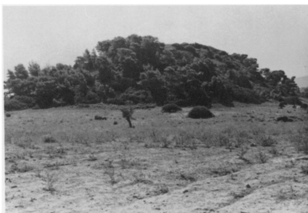
c. Early Helladic site at Dourakhos from the north