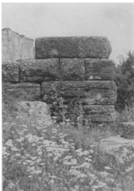
a. Northeast tower from the east