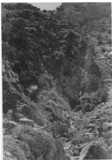
e. Ravine east of Mávro Límni from the north