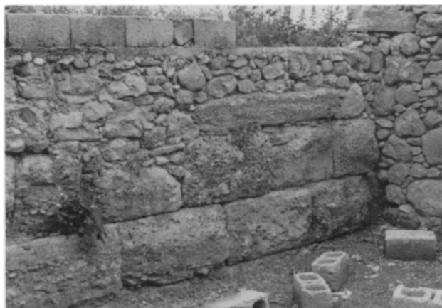
b. Part of the east circuit wall from the east