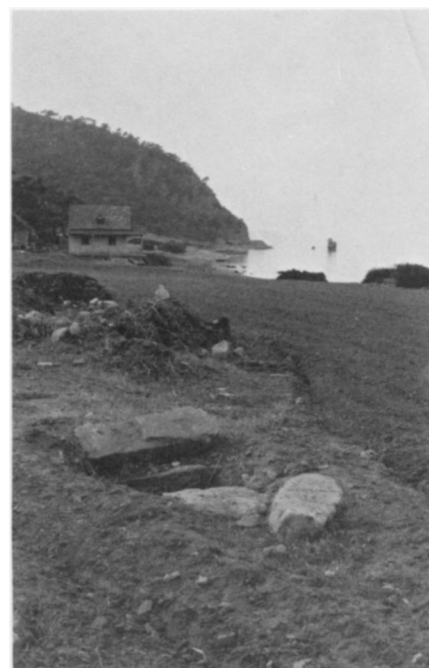
d. Coastal road and ridge from the east. Late Roman burial in foreground