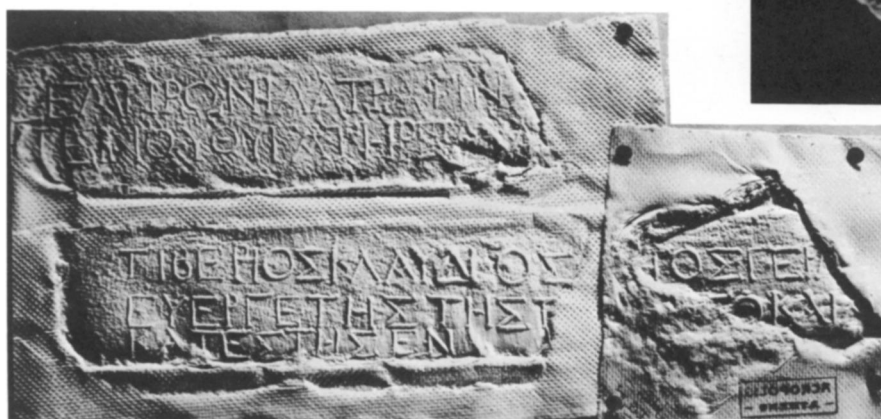
No. 7 E.M. 4385 + Acropolis fragment = I.G. , II 2 , 5179