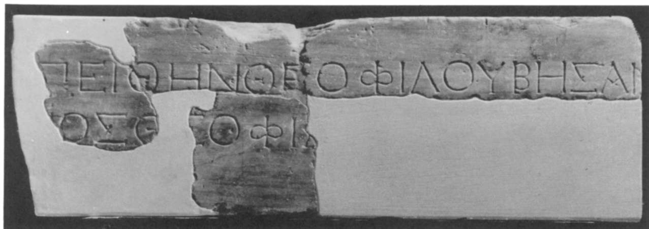
I.G. , II 2 , 3872 (see No. 5)