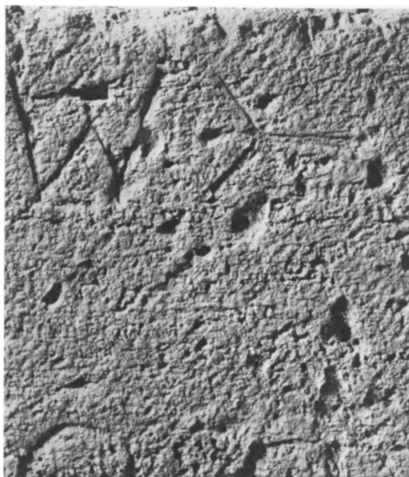
No. 1, Detail