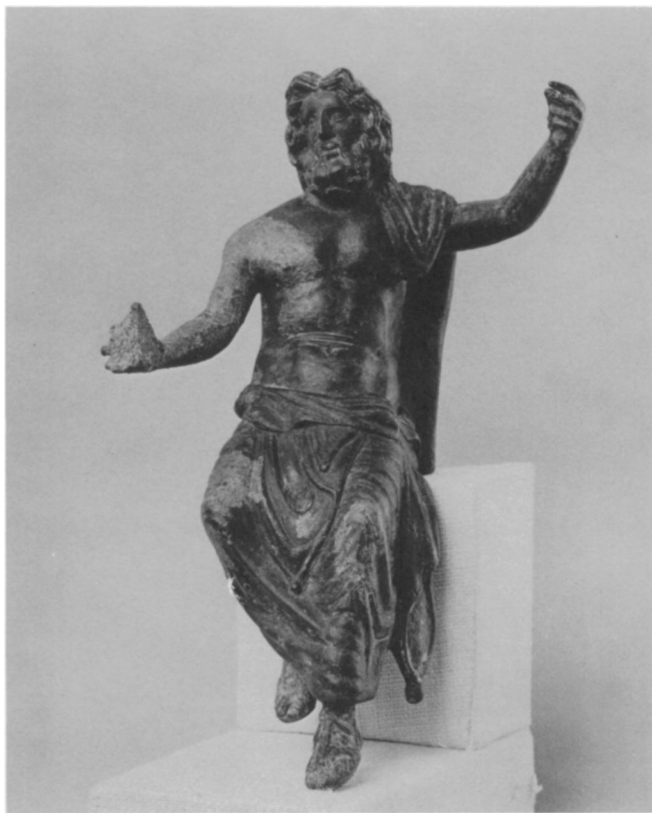
d. Zeus of Caesarea in Cappadocia, holding Mount Argaeus. Boston, Museum of Fine Arts.