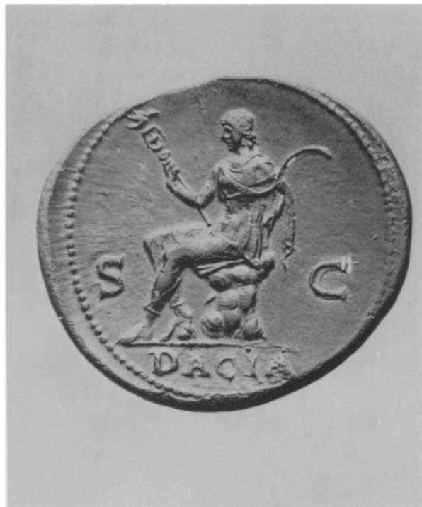
b. Dacia. Reverse of a sestertertius of Hadrian.