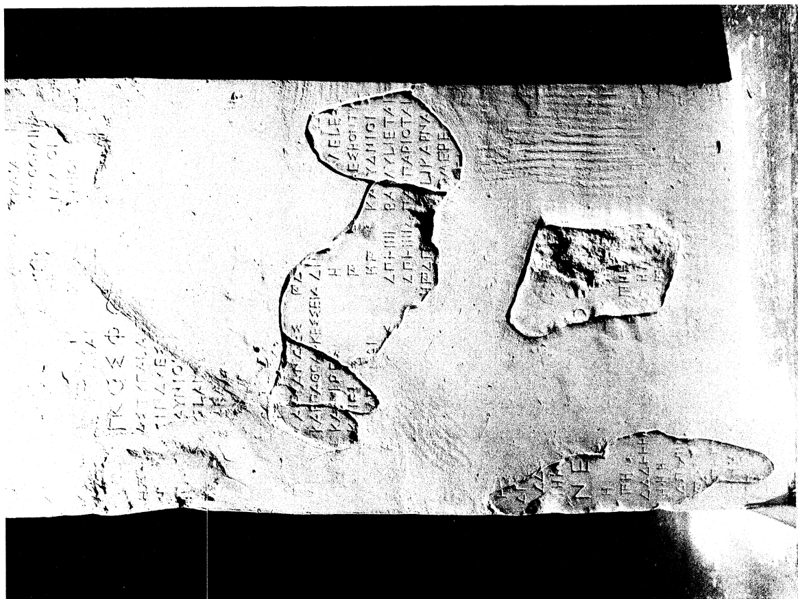
b. List 15: the lower fragments in the rebuilt stèle