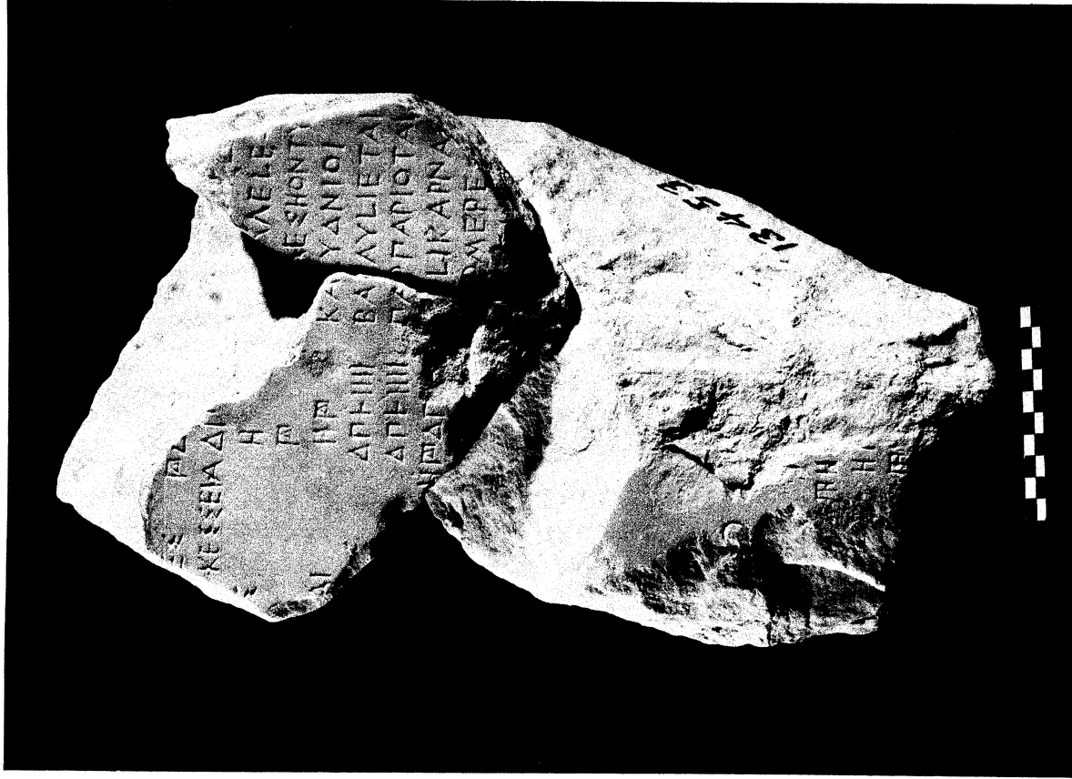
b. List 15: fragments 180 and 63 in place on fragment 181

MALCOLM F. MCGREGOR: THE NEW FRAGMENT OF THE FIFTEENTH QUOTA-LIST