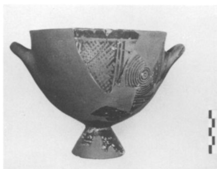
c. Protogeometric skyphos