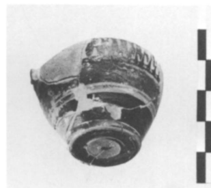
e. Miniature skyphos of Corinthian type