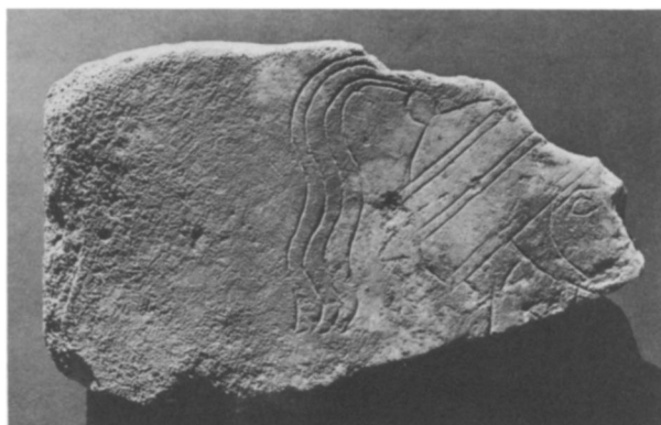
b. Marble slab with Mycenaean warrior