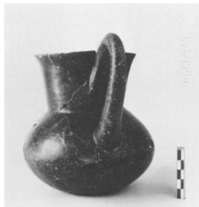
c. Tankard. Early Bronze Age III