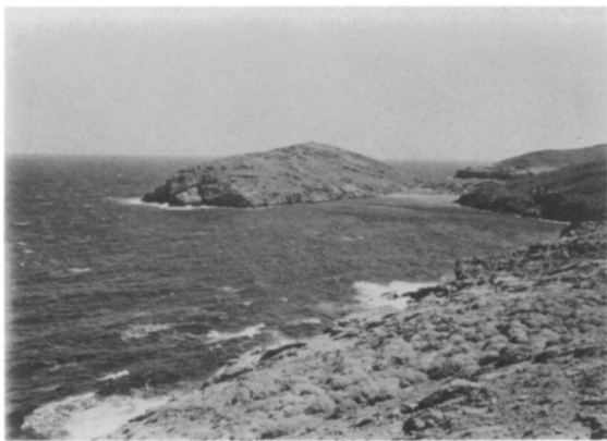
a. Headland of Kephala from southwest