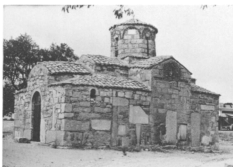
g. Eleventh-century church at Ligourio in Epidauria