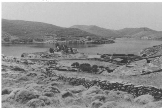
e. Ayia Irini, the bay and Vourkari from north