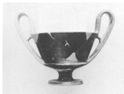
j. Black-glazed kantharos of Boiotian type