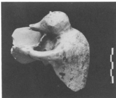
b. Fragment of zoomorphic pot, the "Teddy Bear with begging bowl." Early Bronze Age II