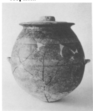
d. Middle Cycladic jar used as burial urn