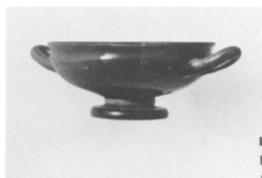
h. Attic black-glazed cup of Type C. Late 6th century