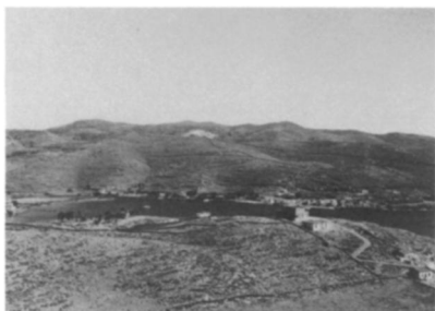
c. View southeastward toward Ioulis