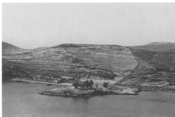
g. Ayia Irini and terraced hill behind, from south