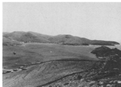
d. View south-southwestward toward Korissia