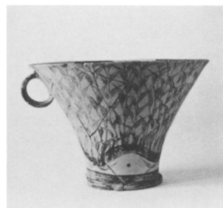
f. Cup with reed pattern. Late Minoan IB