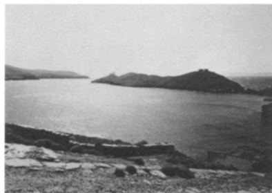
f. View southwestward to the harbor mouth