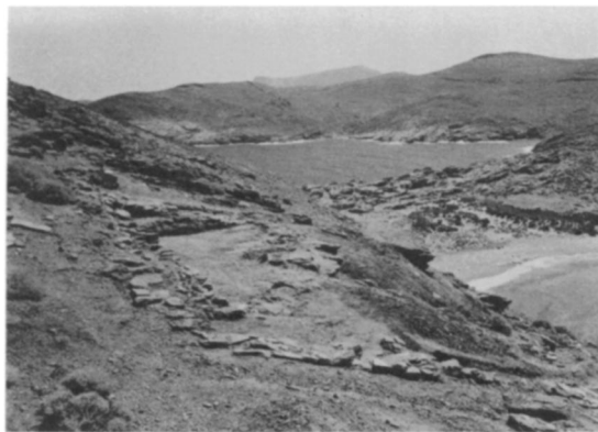
b. Remains of a Neolithic house at Kephala