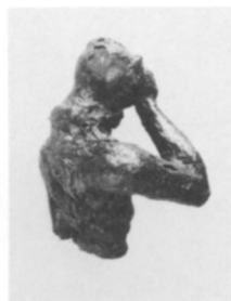
i, j. Minoan bronze statuette from the temple. Late Bronze Age IA-B