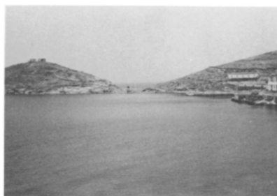
i. Katsonis Gap. Keos