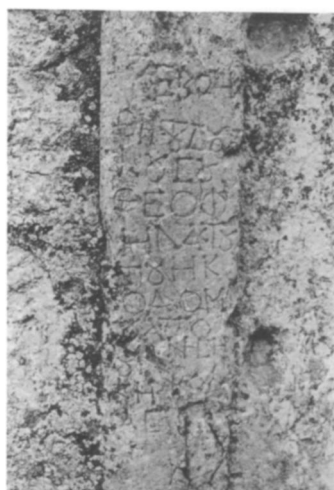
f. Inscription at Ligourio