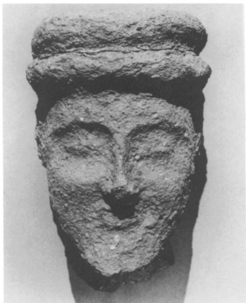
h. Head of terracotta statue from the temple. Late Bronze Age (I-II)