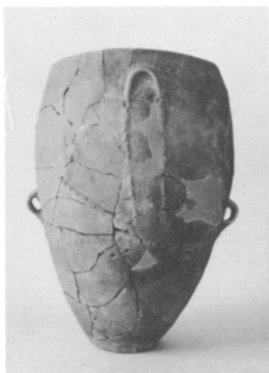
a. Late Neolithic jar used as burial urn, from Kephala