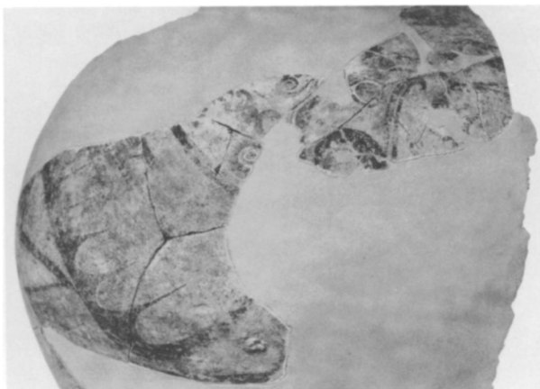
e. Shoulder fragment of large jar with griffins. Late Bronze Age I.