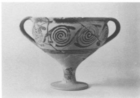
a. Kylix. Late Helladic IIIA1