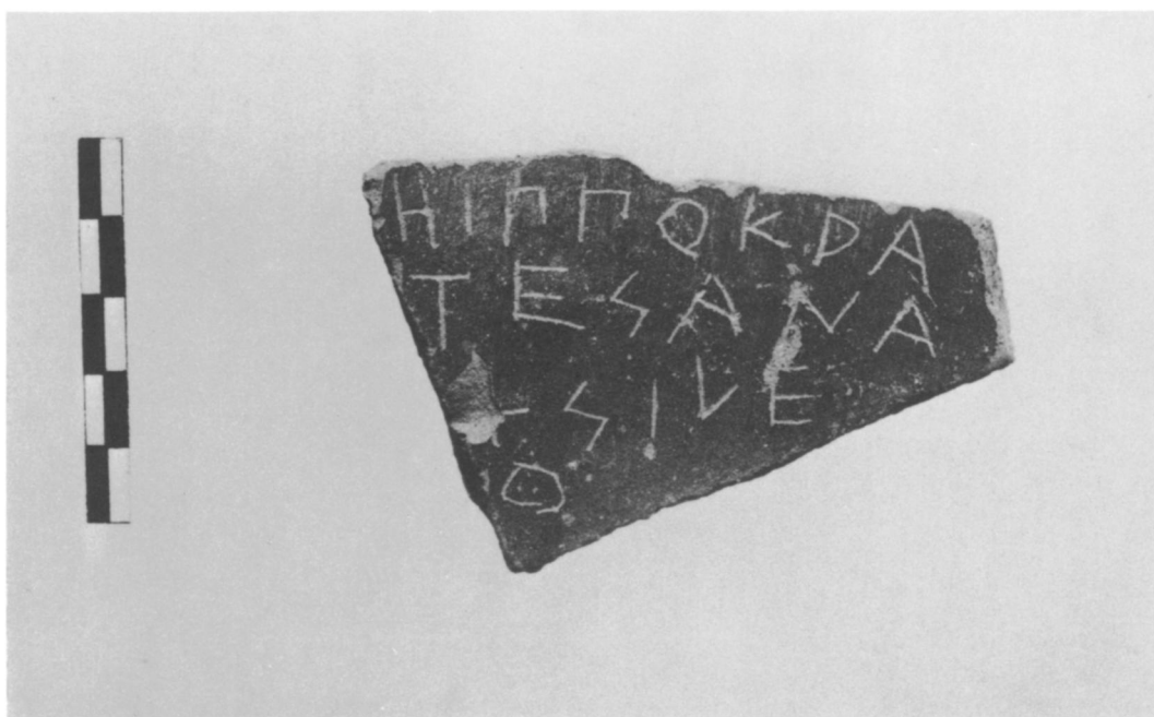
b. Ostrakon from the Athenian Agora, P 2702