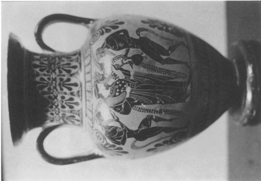
a. Neck-amphora, Rugby 11. Side A