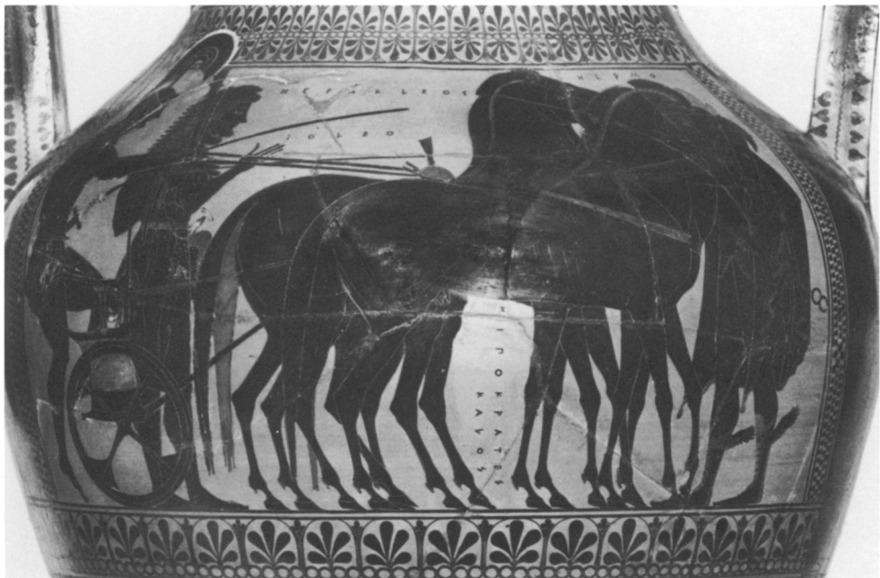
b. Bilingual amphora, Munich 2302.

H. A. SHAPIRO: HIPPOKRATES SON OF ANAXILEOS