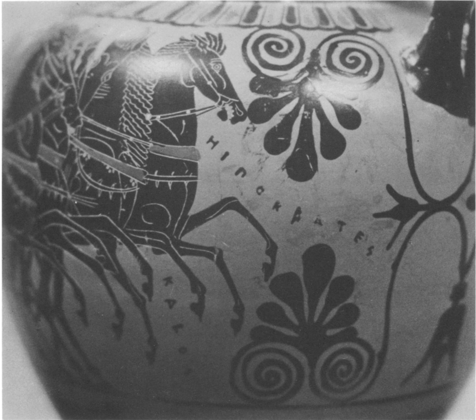
a. Neck-amphora, Rugby 11. Detail of Side B