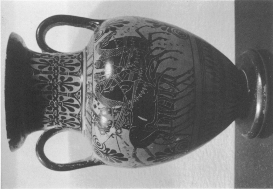
b. Neck-amphora, Rugby 11. Side B

H. A. SHAPIRO: HIPPOKRATES SON OF ANAXILEOS