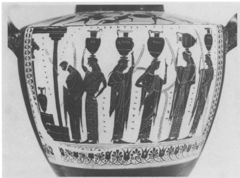
a. Hydria, London B331.