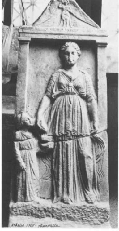
g. Athens, N.M. 1305