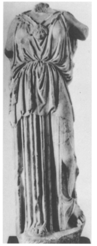
a. Athens, Akropolis Museum 1336