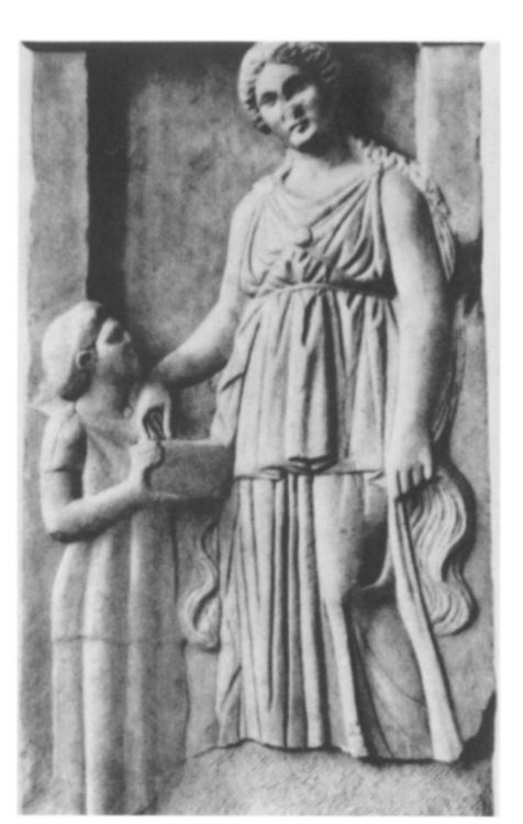
e. Berlin, S.M. K40