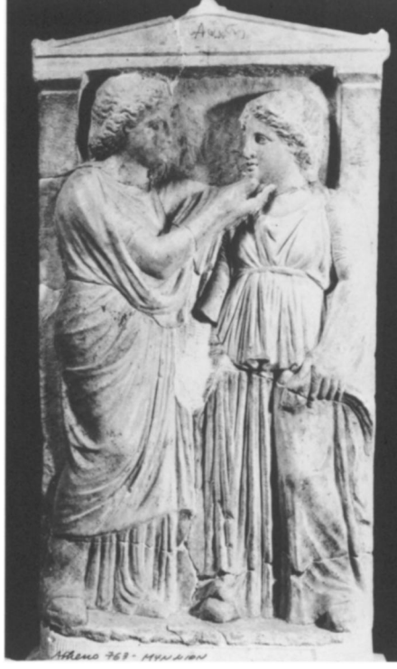
f. Athens, N.M. 763