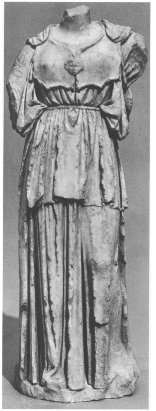
a. Athens, Agora Museum S 2337 (1)