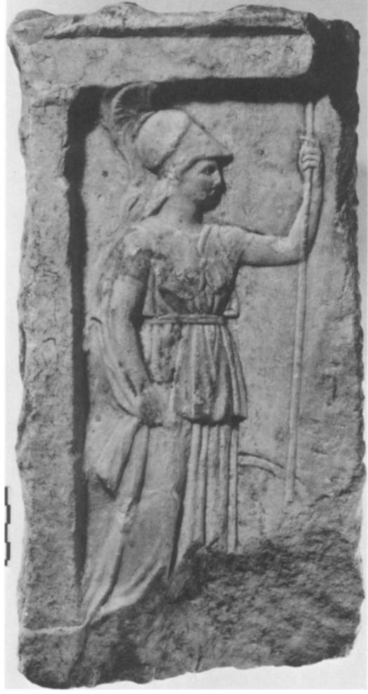
6. Athens, Agora Museum S 2311