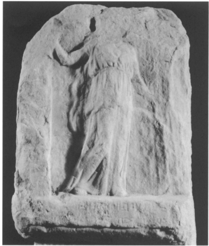
3. Athens, E.M. 2802a