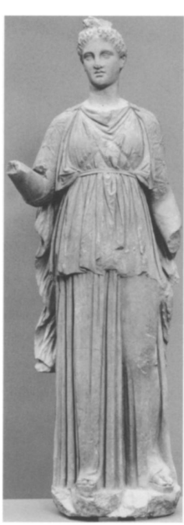
c. New York, M.M.A. 44.11.2