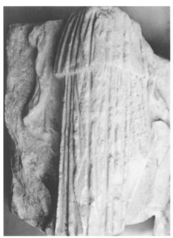
11. Athens, Akropolis Museum 2543