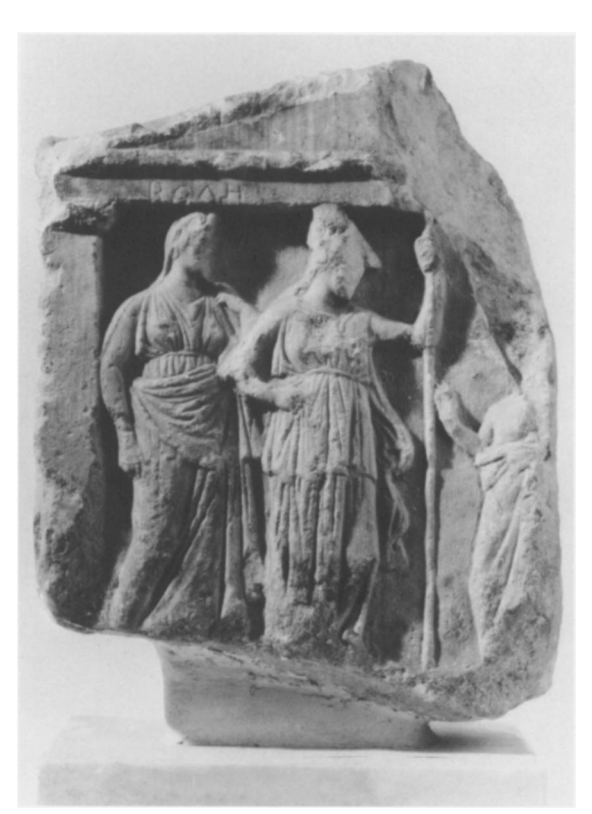
4. Athens, N.M. 1473