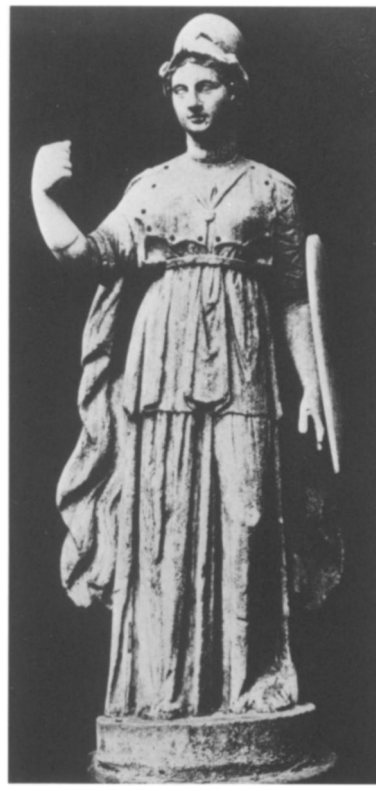
2. Florence, Palazzo Corsini