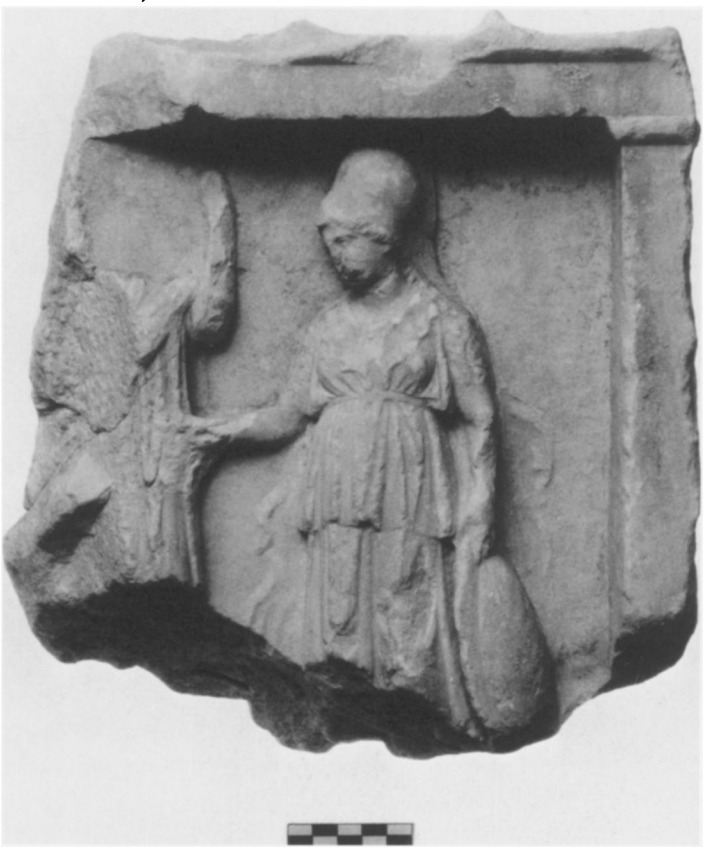
5. Athens, Agora Museum S 1139 LINDA JONES ROCCOS: ATHENA FROM A HOUSE ON THE AREOPAGUS