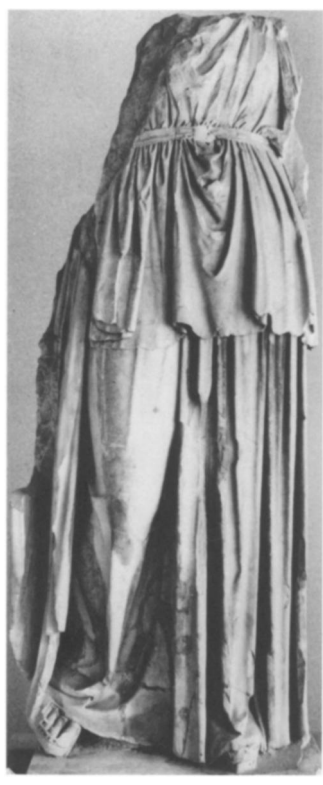
b. Athens, Agora Museum S 2154