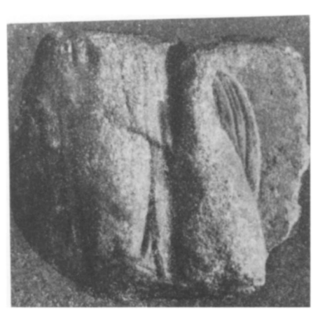
10. Athens, Akropolis Museum 2541