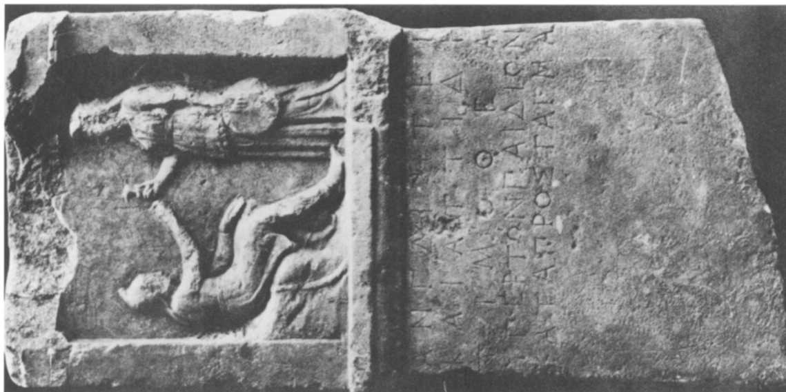
a. Marble relief of Attis and Angdistis from the Piraeus (Vermaseren 1982, fig. 308)