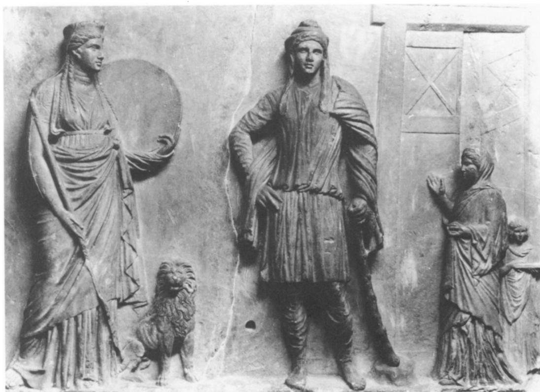
b. Relief of Meter and Attis, provenience unknown, in Venice