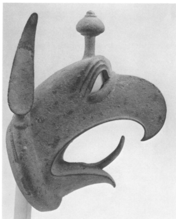
b. New York, M.M.A. 1972.118.54