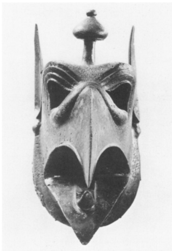
c. Olympia, B 145 + B 4315