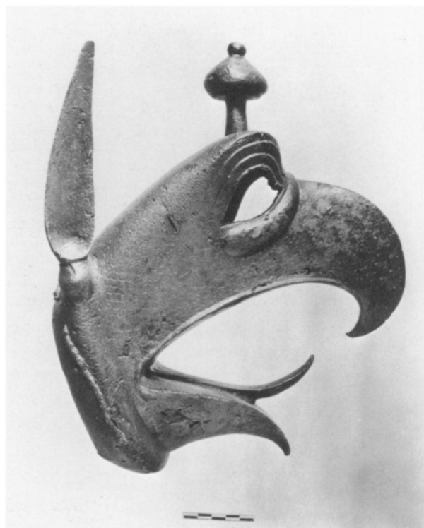
b. Olympia, B 145 + B 4315