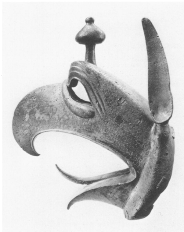
a. Olympia, B 145 + B 4315