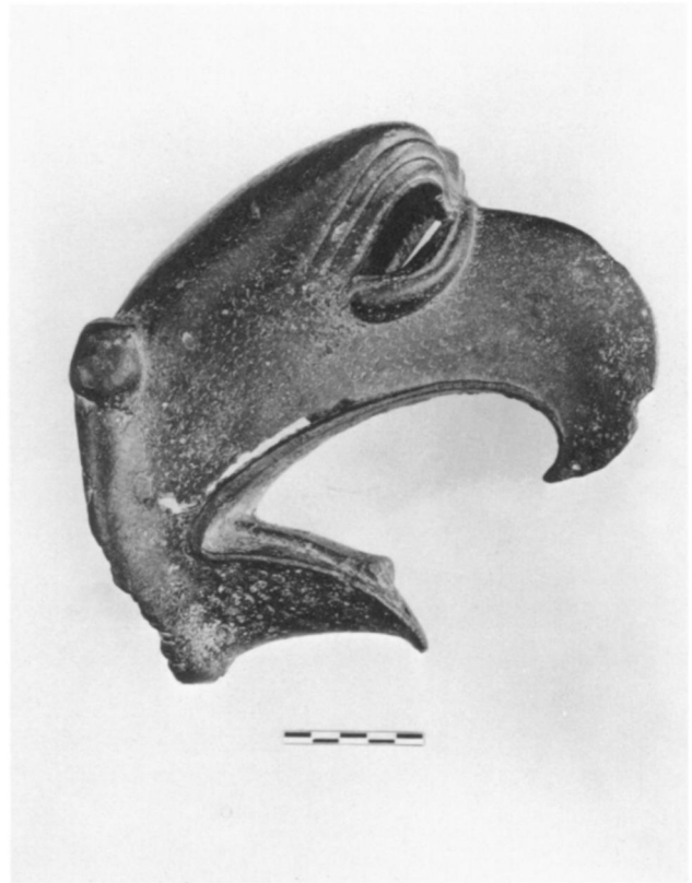
b. Athens, N.M. 7582 (photo DAI Athens, neg. no. N.M. 4154)