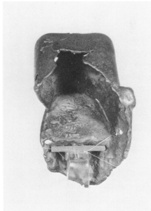
d. Athens, N.M. 7582