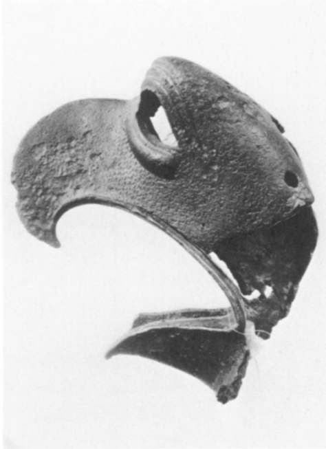
a. Athens, N.M. 7582