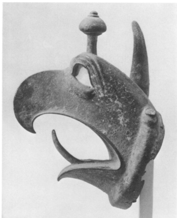
a. New York, M.M.A. 1972.118.54