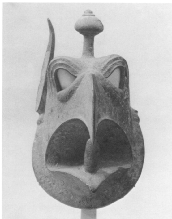
c. New York, M.M.A. 1972.118.54