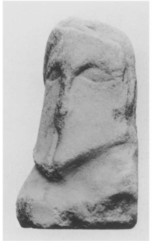
b. AS 196. Right side.