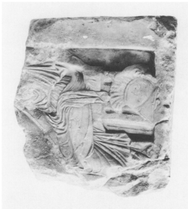
a. Athens, N.M. 2983: Attic relief. Late 5th century B.C.