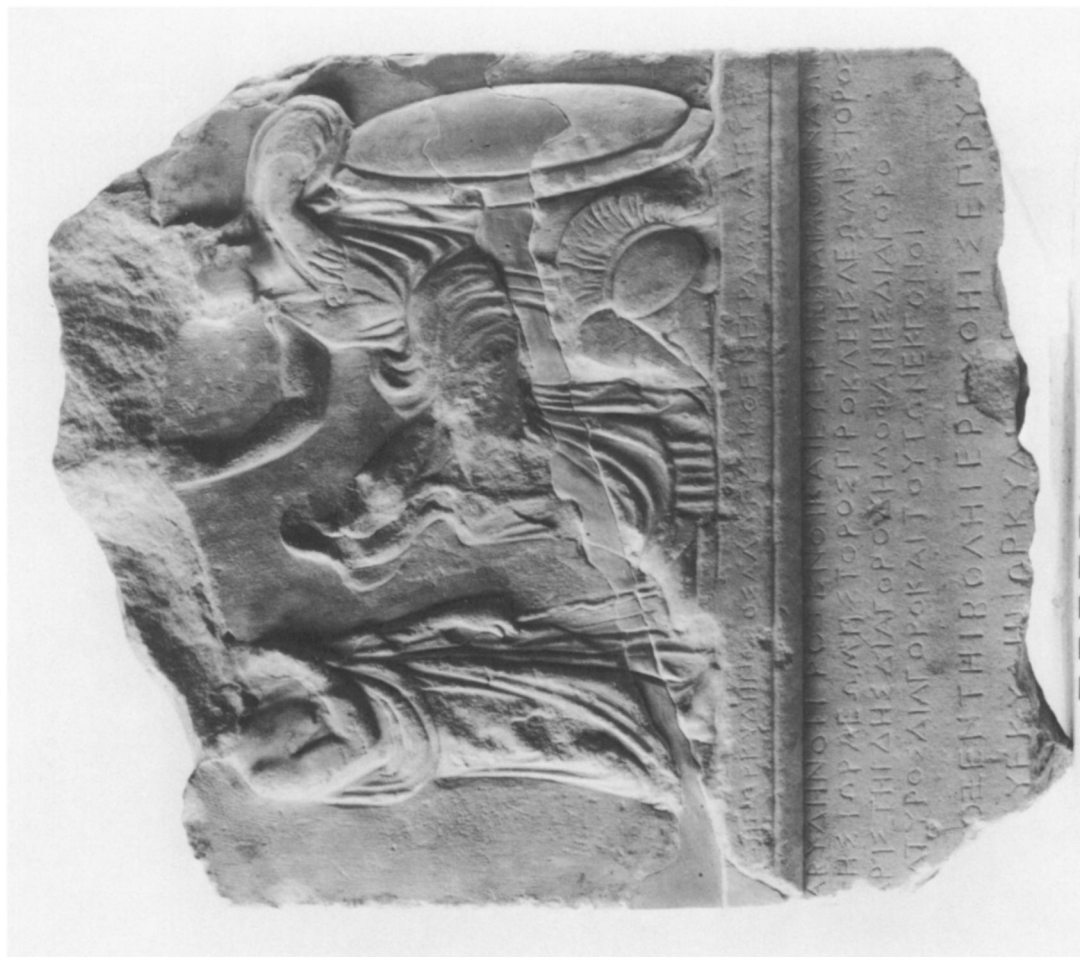
b. Athens, Akropolis Museum 1330: relief from proxeny decree ( IG II 2 49), Early 4th century B.C.