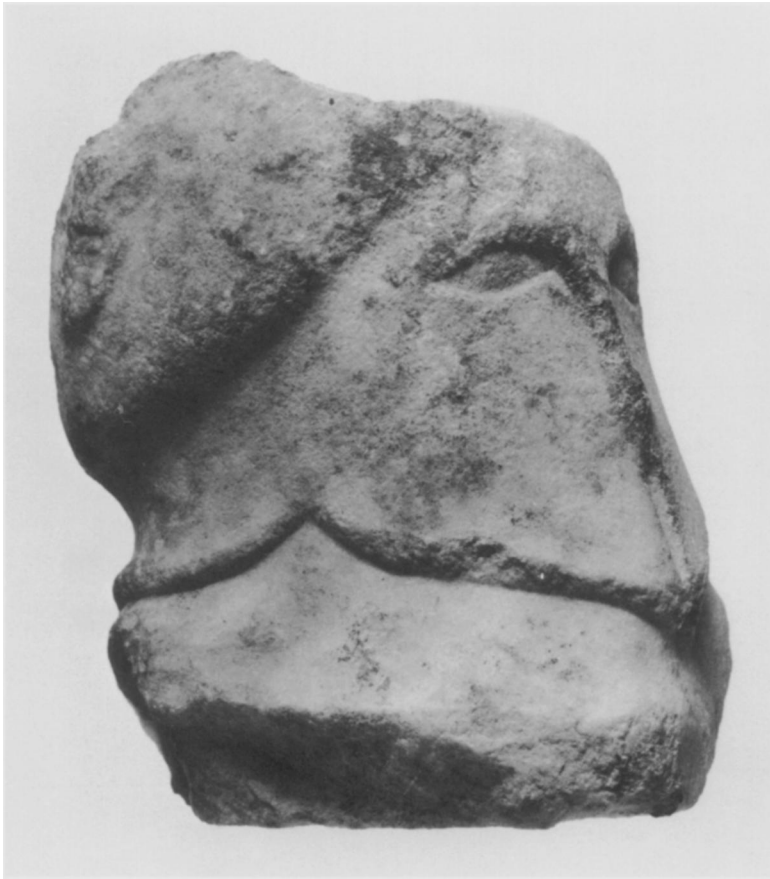
a. AS 196. Corinthian helmet from relief, found on the North Slope of the Akropolis. Front. Late 5th century B.C.