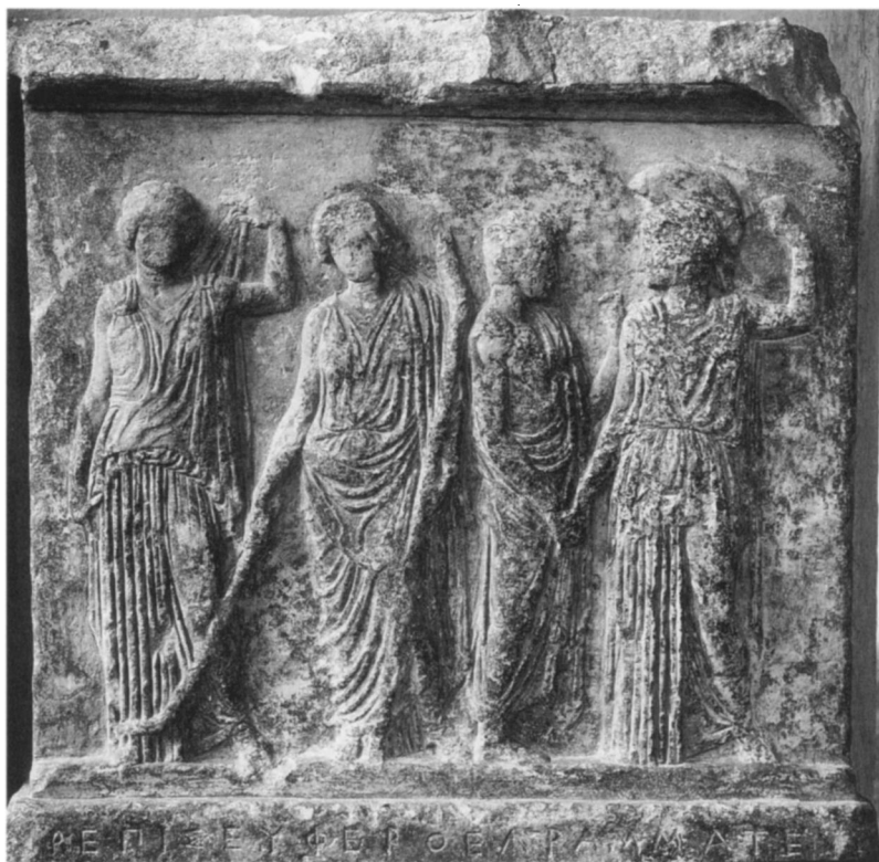
Figure 2. Rheitos Bridge decree. Eleusis Museum 5093.

collar aegis and an Attic helmet. Since there are other 5th-century relief images and three later freestanding versions of this type, these representations may reflect an original statue of Athena created ca. 425 B.C., shortly before the Rheitos Bridge decree. 32