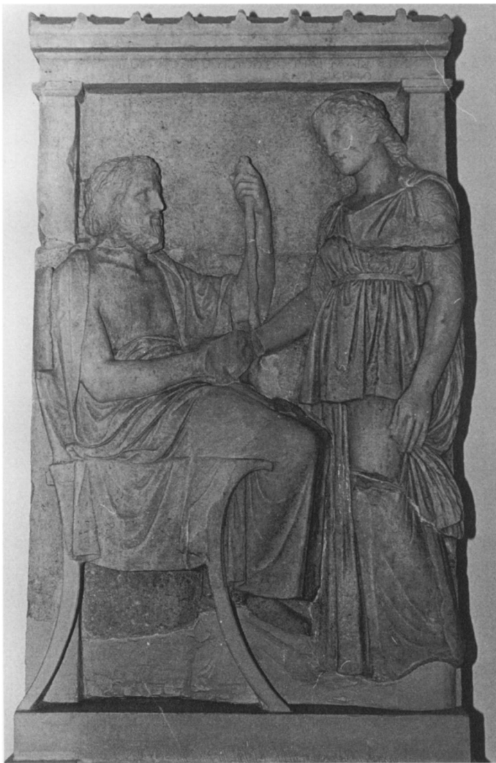
Figure 11. Stele, Stratyllis (9). Athens, National Museum 3691.

includes some of the maidens, 103 and Kokula provides some dates in her study of marble loutrophoroi. 104 Ursula Vedder dates 4th-century funerary monuments and includes some newly published stelai. 105 In studying 4th-century chronology, Timotheos Lygkopoulos calls the New York maiden (Fig. 1) the “last grave monument.” 106 He breaks up the century into five groups that accord well with the chronology of the stelai depicting maidens, which fall into his last three groups: III, 370–350; IV, 350–330; V, 330–306. Scholl includes only five stelai and vessels with maidens in his