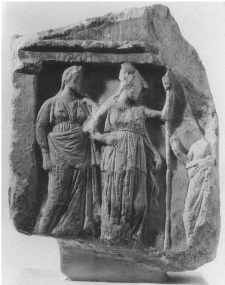
Figure 3. Boule relief. Athens, National Museum 1473.

for Artemis, the maiden goddess with a special relationship to young girls and unmarried young women; the Brauronian Arkteia was a festival for very young girls. 36 Older girls dedicated their belts (and toys) to Artemis Lysizonos before marriage; on a red-figure lekythos in Syracuse a maiden wearing a peplos unties her belt before Artemis. 37 Tullia Linders studied the inventories of dedications to Artemis Brauronia on the Acropolis and found that the overwhelming majority were women's garments, as Pausanias (1.23.7) had recorded. 38 A type of pinned back-mantle without an overfold can be seen on images of Apollo Patroos in Athens and Apollo Kitharoidos in Delphi. 39 The pinned back-mantle over the belted peplos appears not only in Attica but in places influenced by Athenian art: Cyrene in North Africa and Gortyn on Crete. 40