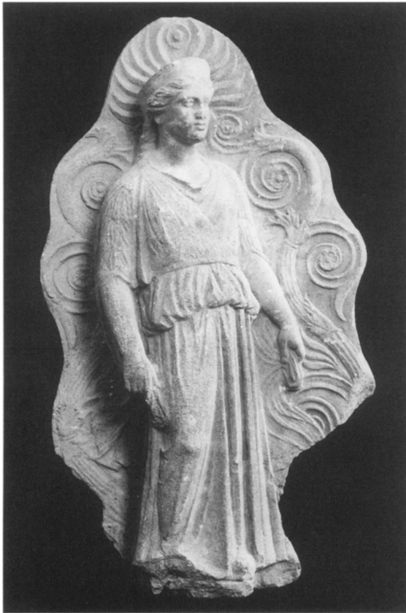
Figure 12. Acroterion (5). Athens, National Museum 744.

inherited from the Erechtheion caryatids. Later, after mid-century, the side edges hang down in fluttering, cascading, rippling folds. A charming if unnatural effect, the wavy mantle motif seems to be a painterly device, which often approaches an abstract pattern as on the Acropolis relief base (59, Fig. 7).