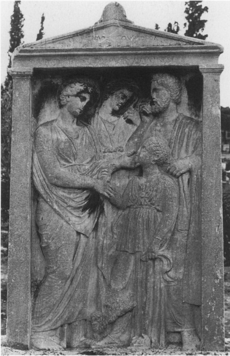
Figure 9. Stele, Eukoline (1). Athens, Kerameikos Museum 8754.

the peplos. This difference in dress has been explained in various ways. C. J. Herington had earlier proposed that the two processions led to different sacrifices: the northern one for Athena Polias, religious in nature, and the southern one for Athena Parthenos, a civic rite. 98 Harrison recently proposed that the north procession with its loosely arranged tribal units of four depicted an earlier time period, and the south procession depicted contemporary times with Kleisthenes' ten tribal divisions represented by differences in garments worn by ranks of riders. 99 Thus, Harrison suggests that the chiton was worn under the peplos in contemporary Athens, by the maidens in the south procession, while the peplos was worn alone in earlier times. On Classical Athenian grave monuments, most women wear a chiton under the peplos or himation, 100 possibly also representing contemporary styles. Those wearing only the peplos may indeed refer to an earlier era, representing families with more historical ties to Athens. Maidens who wear no chitons in the cult scenes on votive reliefs are surely taking part in a traditional sacrificial ritual.