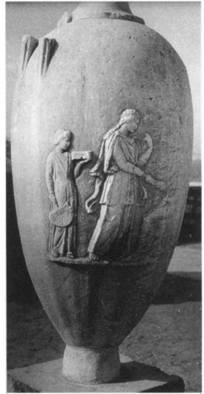
Figure 5. Loutrophoros, Plangon (46). Eleusis Museum 5098.

Like the Erechtheion caryatids, most of the 4th-century maidens hold the edge of the mantle with their lowered hand. Semni Karouzou suggests that the motif of holding the edge of the mantle came from a famous source, possibly the Erechtheion caryatids themselves. 58 Holding the edge of a garment seems to us a rather feminine mannerism, but it may have been a sign of youth in antiquity. Youths and boys on grave stelai often hold one edge of their mantle, as Aristion and Stephanos do on two 4th-century stelai in Athens. 59 The young Triptolemos on the Great Eleusinian Relief in Athens also holds the edge of his mantle with one hand, but in a more naturalistic manner. 60