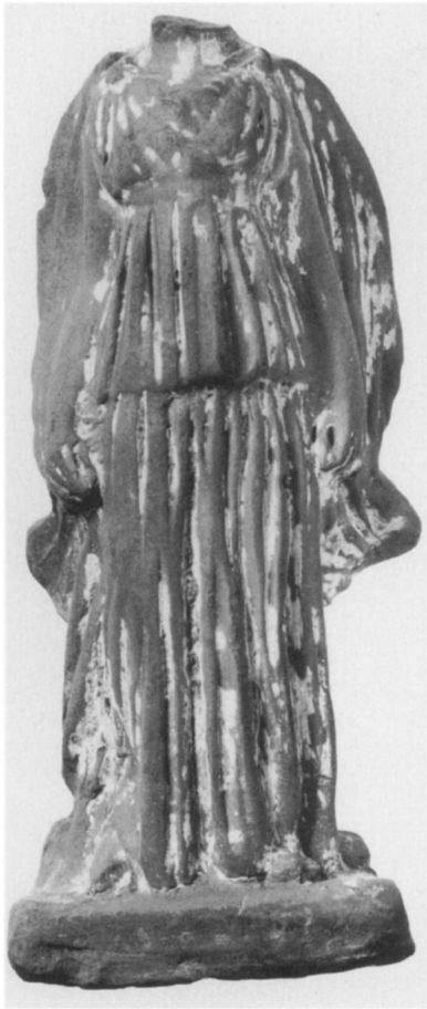
Figure 8. Terracotta statuette. Athens, Kerameikos Museum 8166, 8185, 13443.

dence for the peplos in the Early Classical period and concludes that the peplophoros had special meaning as a sign of Hellenic identity. 69 Lee also provides an exhaustive study of the scholarship on the peplos from the Renaissance to the present day, as well as a list of the relevant ancient literary sources.