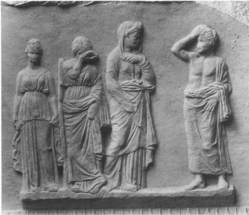
Figure 7. Relief base (59). Athens, First Ephoreia (Fethiye Djami).

nian Agora. 64 The back-mantle is worn only by mortal maidens and maiden goddesses on votive reliefs and votive terracotta statuettes.