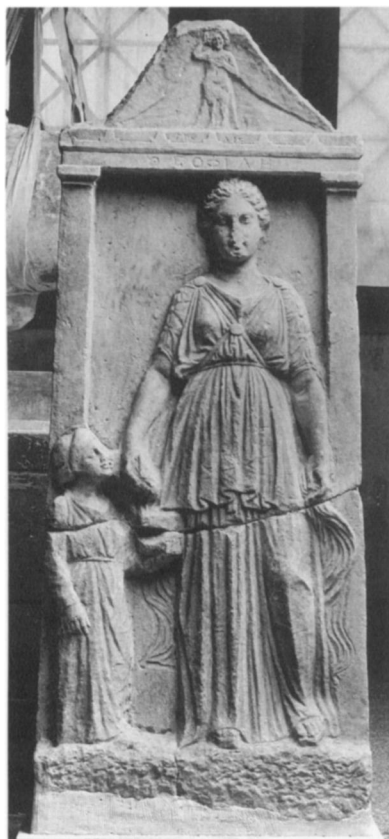
Figure 4. Stele, Theophile (20). Athens, National Museum 1305.

Two figures of Athena illustrate different methods of representing the pinned back-mantle in the Classical and Late Classical periods. The back-mantle on Athena in the Rheitos Bridge decree from the 5th century has zigzag side folds. Shortly after 340 B.C., the back-mantle is shown with curvilinear side folds, as on figures of Athena on document and votive reliefs, such as the Boule relief in Athens (Fig. 3), as well as on later statues. 41 I have named the 4th-century type the “Areopagus House Athena” after the findspot of a well-preserved Roman version. This type recalls in a deliberately classicizing manner the dress of two 5th-century examples: the back-mantle of the Rheitos Athena and the large aegis of the Parthenos. In style, the Areopagus House Athena is close to some of the later maidens with back-mantle, such as Theophile (20, Fig. 4). Contemporary with the Areopagus House Athena type is a statue of Themis or Demokrateia in the Athenian Agora, about which Palagia writes: “its classicism is contrived and heralds the end of the Classical era.” 42 The Areopagus House Athena is a similarly retrospective creation of the Lykourgan period in the third-quarter of the 4th century B.C., the era characterized by Fordyce Mitchel as recreating the Periklean era in a self-consciously deliberate manner. 43 It is in this period that most of the images of maidens in back-mantle and peplos occur.