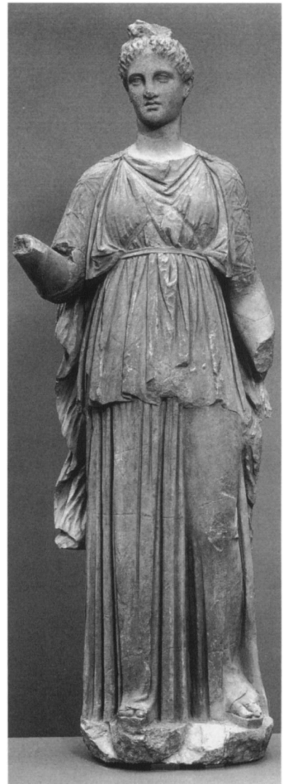
Figure 1. Statue of a maiden. New York, Metropolitan Museum of Art 44.11.2.

The earliest example of the pinned back-mantle with belted peplos is worn by Athena on the Rheitos Bridge decree of 422/1 B.C. in Eleusis (Fig. 2). 31 Athena wears the back-mantle over an Attic peplos, with a small