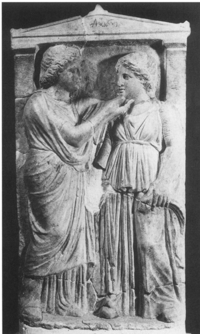
Figure 10. Stele, Mynnion (6). Athens, National Museum 763.