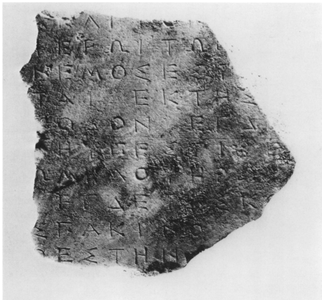
1 a. I 4936 b