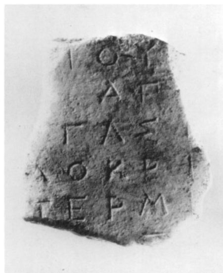
1 b. I 4936 c