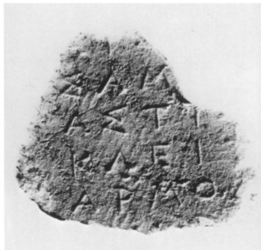
3. I 4934