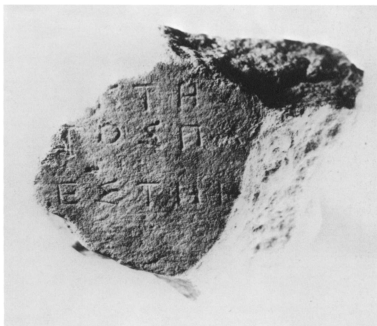
1 c. I 4936 a