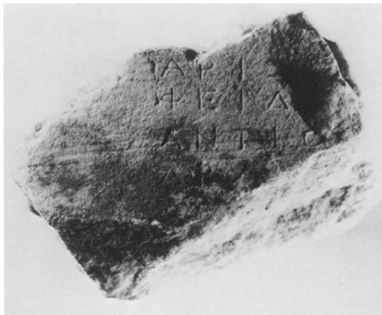
2. I 4604