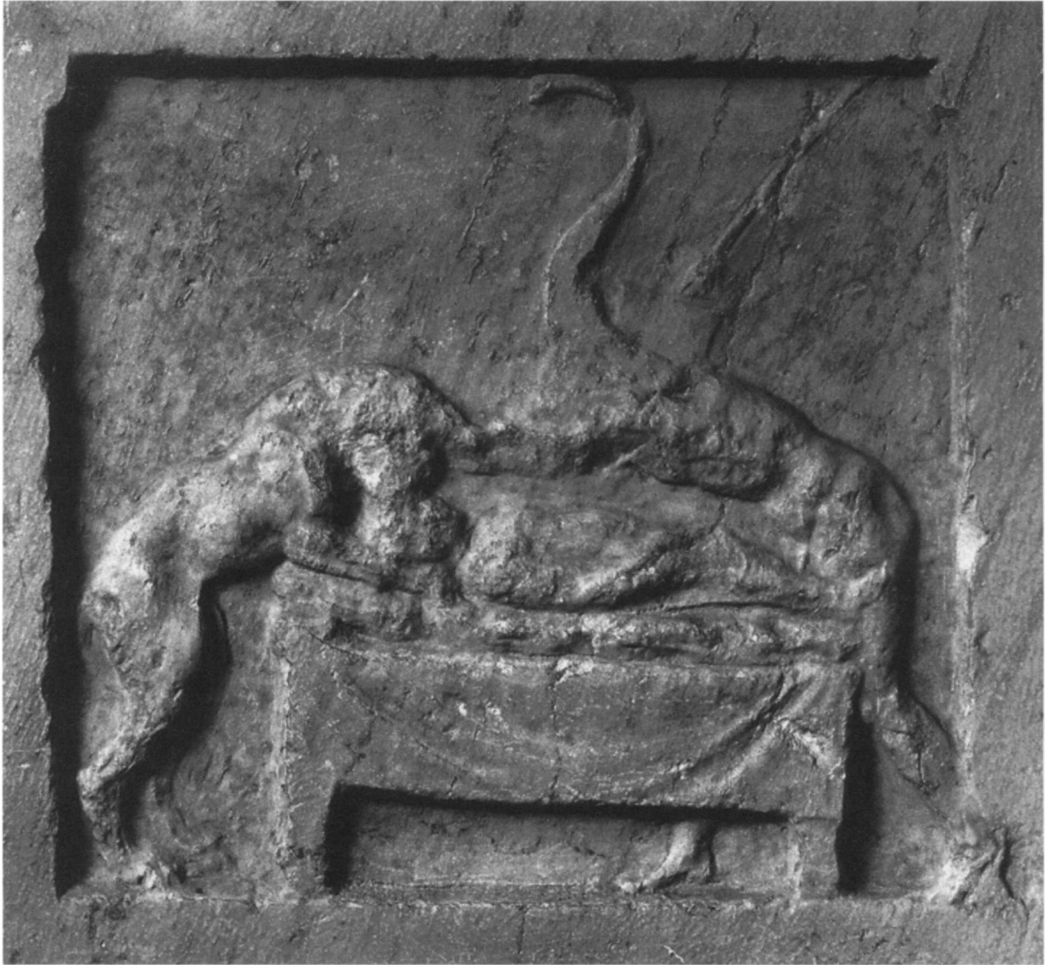
Figure 4. Stele, sculpted relief.

ment. 24 His muscular body, nearly twice the size of the corpse, seems an adequate match for the similarly robust lion. 25 The man's nakedness conforms to Greek visual tradition. 26