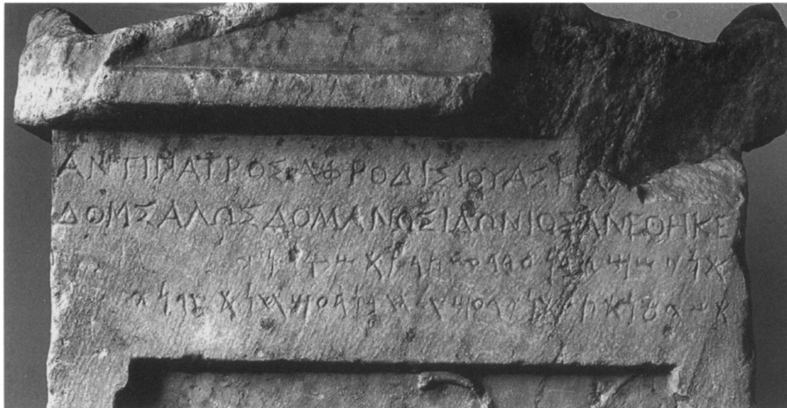
Figure 3. Stele, epitaph.

centering on the mid-4th century. 6 Cross notes that although the small right tail of the shin and the curve of the kaph of the Phoenician inscription first appear in the 4th century, the yod “looks peculiar” and may indicate the 3rd century B.C. 7 Tracy also suggests the 3rd century (see above).