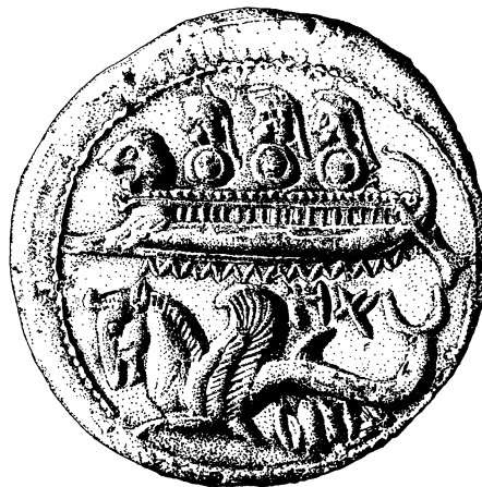
Figure 6. Silver coin from Byblos, 4th century B.C. Scale 1:1. M. L. DeVoe, after Moscati 1988, p. 72