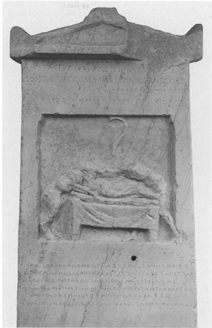
Figure 2. Stele, three-quarter-length view.