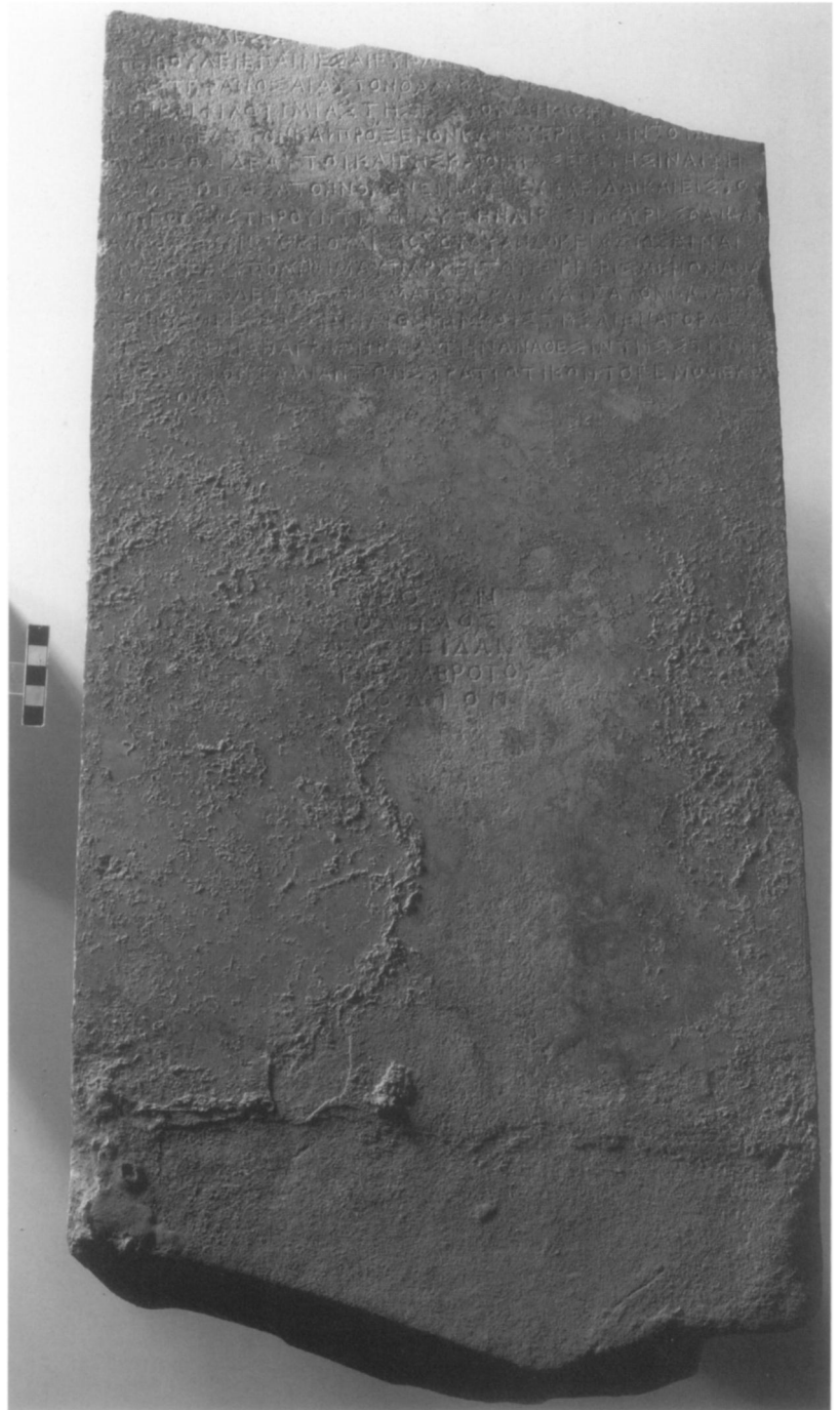
Figure 1. Agora I 7571.

Line 2: Of the dotted theta, the bottom third of a round letter remains on the stone; its center is not preserved. The bottom tips of two slanting strokes consistent with a triangular letter account for the dotted alpha. The dotted iota represents the bottom tip of a central vertical.