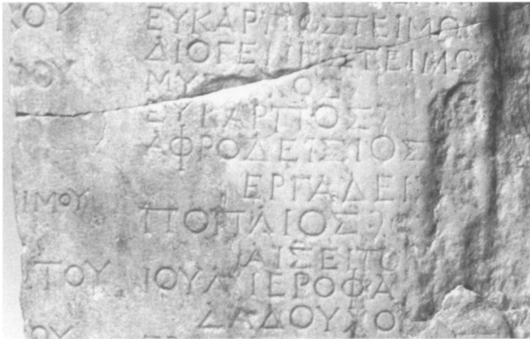
Figure 4. Agora I 7579, detail of lines 47–56.

Line 21: In the first of a series of three worn letter spaces, the surface preserves the top half of omicron, theta, or omega where theta is dotted.