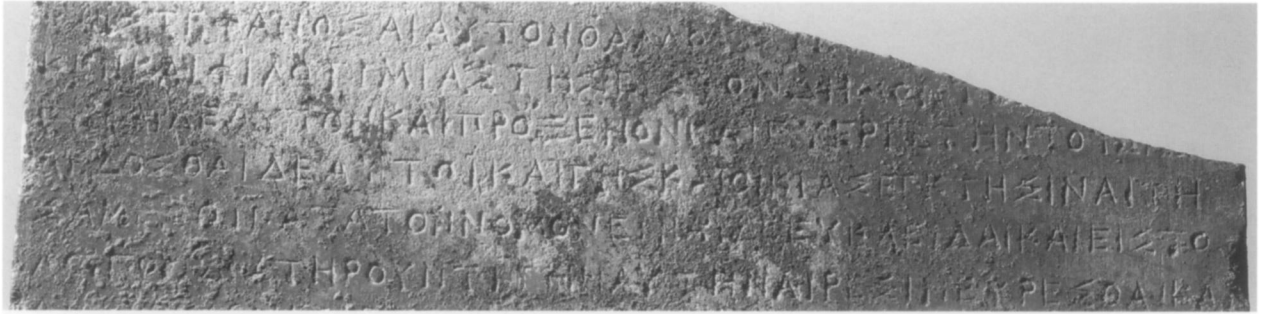
Figure 2. Agora I 7571, detail of lines 4–9.

Line 5: Where omicron is dotted, the top left quarter of the letter space preserves a stroke consistent with omicron, omega, or theta. The bottom tip of a left vertical is preserved where nu is dotted.