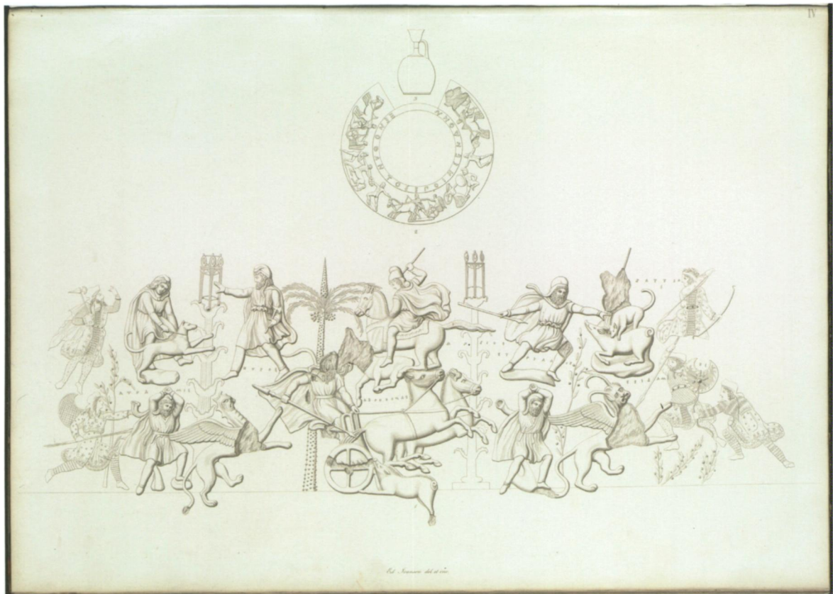
Figure 3. Drawing of the Xenophantos lekythos, St. Petersburg Π1837.2 (St. 1790). Stephani 1866, pl. IV.

This image has eluded explanation, in part because it incorporates Greek and Persianizing elements, and in part because it combines features that belong to the world of reality and to the imaginary. From the “real” world are the landscape elements (which, as we will see, were familiar in Greece) and the Persians, with whom the Greeks had very real interactions; from the fantastic imaginary are the griffins, wild beasts encountered only in stories of exotic and distant—indeed, unreachable—lands. In this way, the image does not easily conform to the traditional classification of the subjects of vase painting as either representations of myth or reflections of daily life. But as scholars have come, in recent years, to explore more fully the potential for images to fall outside of these categories, the time is ripe for a reconsideration of this long-known scene. 3 Here, I investigate the points at which these features of myth and reality come together, as well as the kind of tradition that may be expressed visually by this scene.