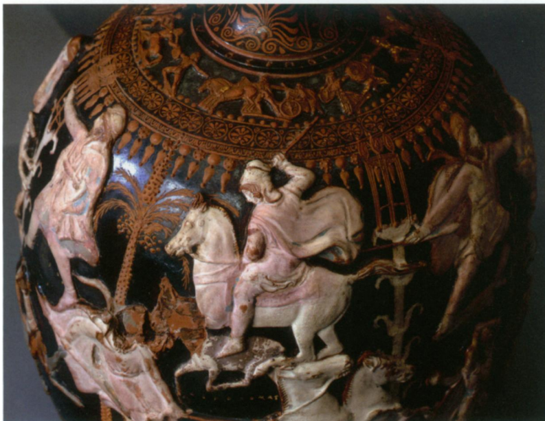
Figure 1. Persian hunt. Red-figure and relief squat lekythos, ca. 400–380 B.C., signed by Xenophantos (potter): front view; detail of hunter labeled “Cyrus.” St. Petersburg, State Hermitage Museum Π1837.2 (St. 1790).