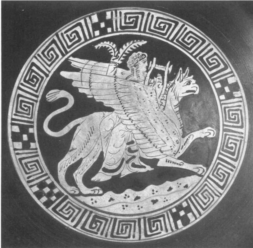
Figure 5. Apollo riding a griffin. Attic red-figure cup, ca. 400–300 B.C. Vienna, Kunsthistorisches Museum 202.

Sources tell, too, of the Hyperborean celebrations in honor of Apollo, in which the god found his greatest satisfaction (Pind. Pyth. 10.35). Diodoros says that all the inhabitants are priests of Apollo, and they praise the god daily with songs and the continuous playing of the kithara in his temple, which is adorned with votive offerings (Diod. Sic. 2.47.2–3). The hero Perseus visited this land, and found its people, crowned with golden laurel, sacrificing hecatombs to the god and dancing to the lyre and to flutes (Pind. Pyth. 10.31–44). Their lives are endlessly joyous and blessed: they live longer and more happily than other mortals (Pomponius Mela, De chorographia 3.36), and they are entirely free from sickness and old age, and from toil and strife and sorrow (Pind. Pyth. 10.31–44; Plin. HN 4.89).