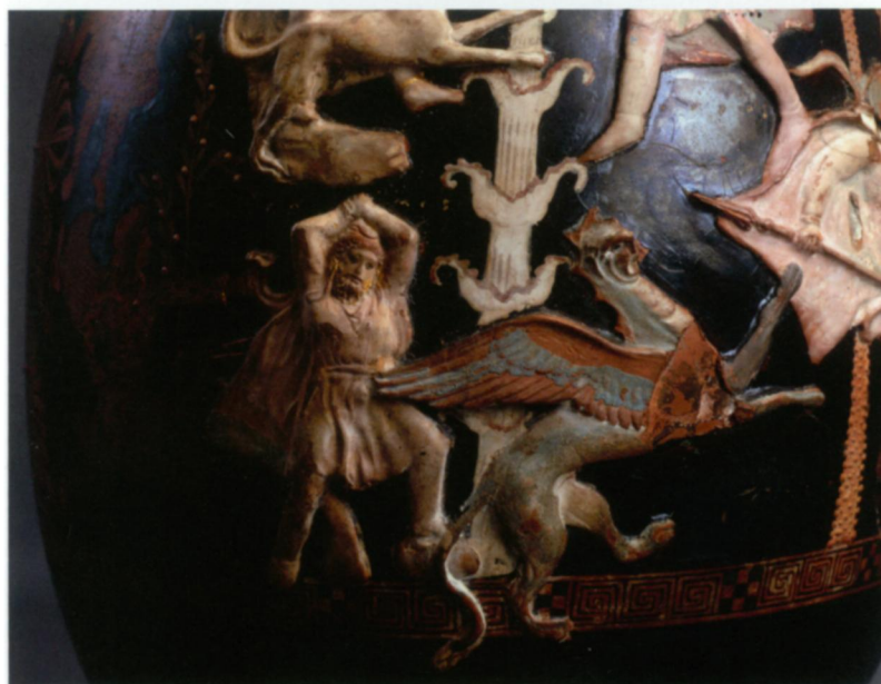
Figure 2. Persian hunt. Red-figure and relief squat lekythos, ca. 400–380 B.C., signed by Xenophantos (potter): view from left; detail of griffin. St. Petersburg, State Hermitage Museum Π1837.2 (St. 1790).