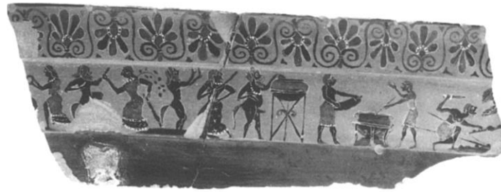
Figure 4. Fragment of an Athenian black-figure volute crater showing a sacrificial scene. Athens, National Archaeological Museum, inv. Akr 654.

fragment of an Athenian black-figure volute crater with a sacrificial scene (Fig. 4), 35 depicting inter alia the cooking of sacrificial meat in a lebes on top of a tripod over a fire. 36 The original use of tripods as cauldron stands during sacrifice may account for some tripod dedications in sanctuaries. 37