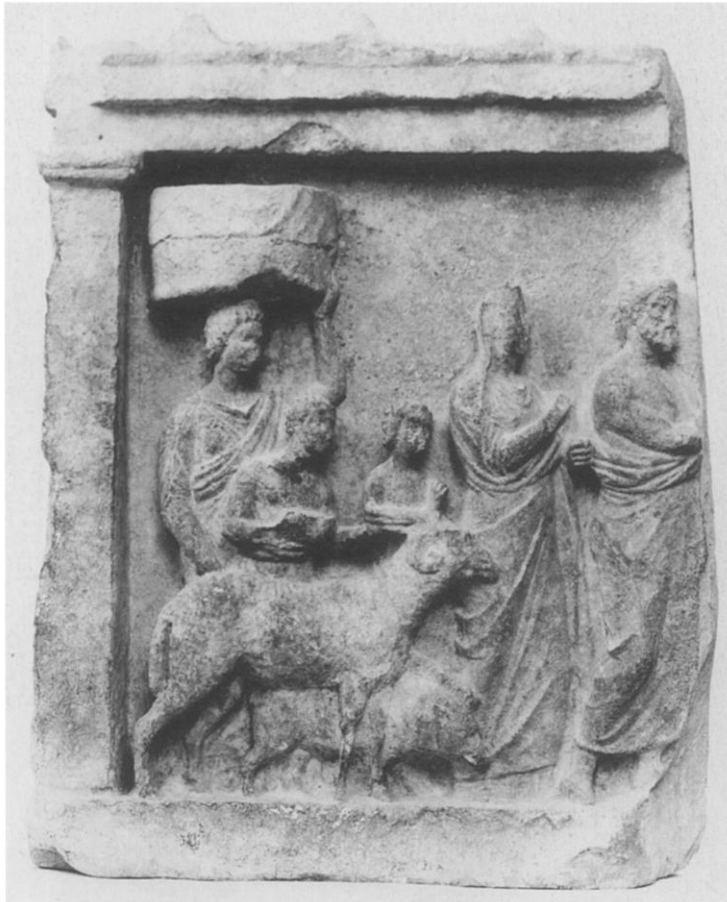
Figure 1. Fragmentary 4th-century B.C. votive relief from the Amphiareion at Oropos showing a pig and a sheep being led to sacrifice. Athens, National Archaeological Museum, inv. 1395.

Pausanias's testimony has again been corroborated by further archaeological discoveries. A fragmentary 4th-century B.C. votive relief from the Amphiareion 12 depicts the incubant on what is clearly sheep fleece. 13 Another 4th-century B.C. relief from the site (Fig. 1) portrays a family (man, woman, child) with two attendants leading a sheep and a pig to sacrifice. 14 As Folkert van Straten notes, 15 the pig or piglet would be offered for purification; the sheep, or rather, ram, would be offered for its skin. What we have here and in Pausanias's description is, in fact, a double sacrifice: the first is offered to a group of concerned divinities; the second is likely to go to the main divinity. 16 Together they comprise a preliminary step leading to the main event, incubation.