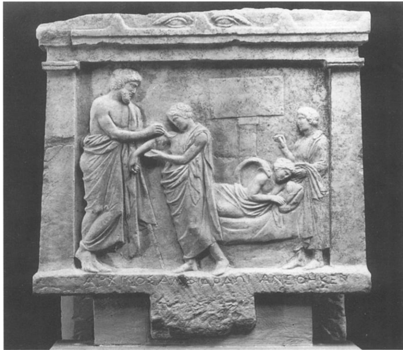
Figure 2. Relief from the Amphiareion at Oropos dedicated to Amphiaraos by Archinos (400–350 B.C.). Athens, National Archaeological Museum, inv. 3369.

to sacrifice whatever they wish, no animal skin is evident in the Archinos relief from the Amphiareion; the incubant is lying on a sheet of cloth that also covers him as his upper body rests against a pillow (Fig. 2; I. Oropos 344, 400–350 B.C.). 18