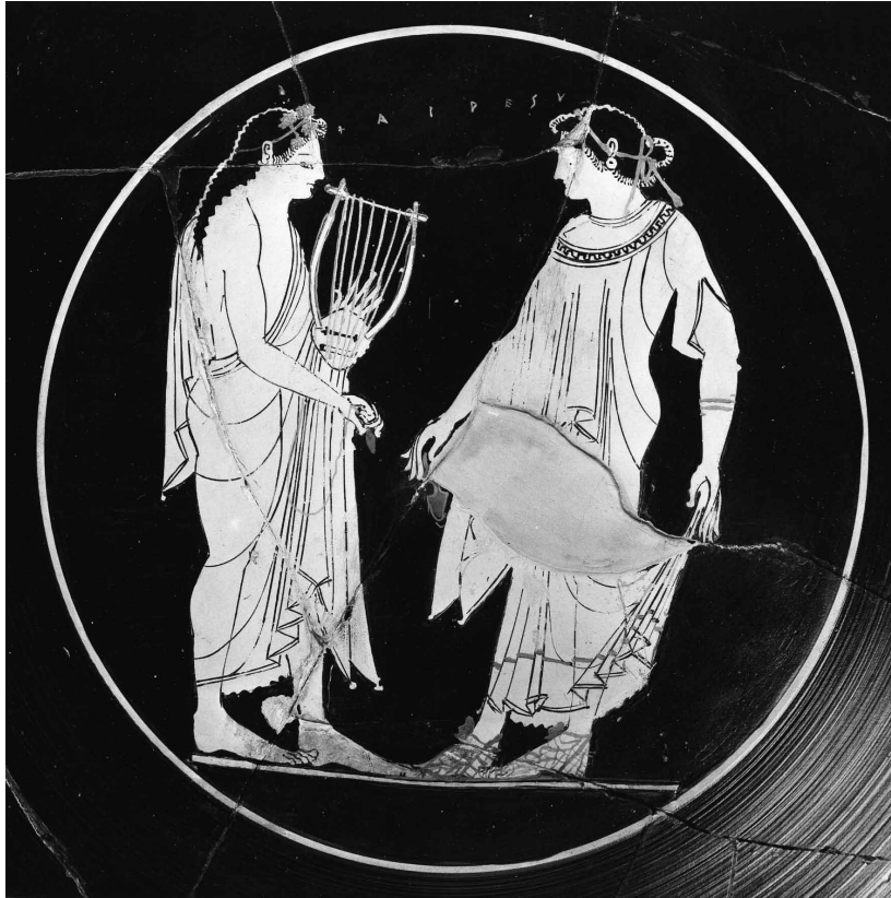
Figure 5. Theseus and Ariadne. Attic red-figure cup, ca. 510 B.C., attributed to Euphronios. London, British Museum E 41 (GR 1837.6-9.58).