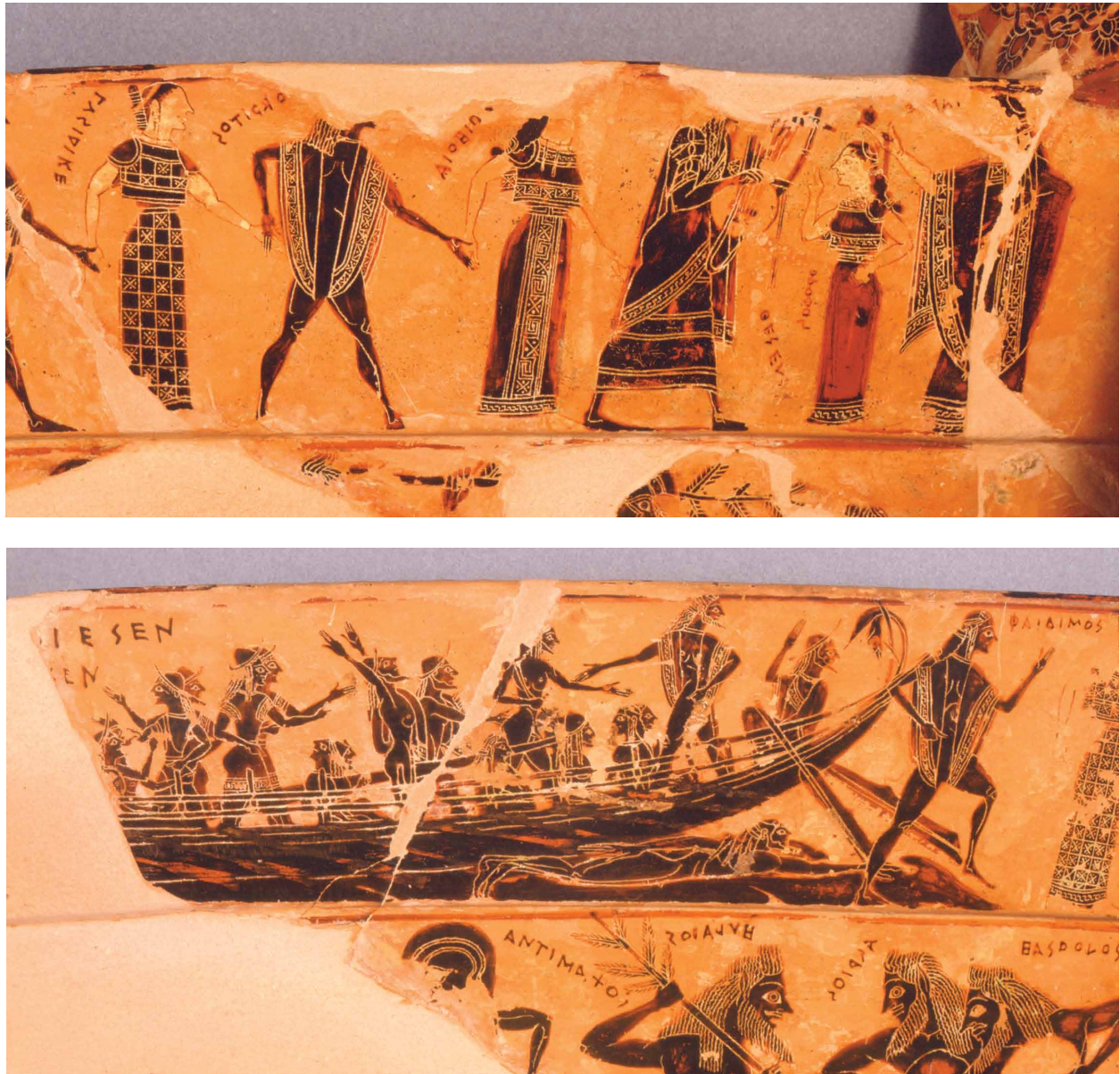
Figure 2. François vase: details of Theseus's Cretan adventure.

In the literary sources, a dance led by Theseus upon his triumph over the monster is associated etiologically with a dance performed in historical times on Delos. The Delian dance was called the geranos , or crane dance. The literary descriptions lead one to expect a dance that takes place after the victory over the monster, and one that is primarily circular and secondarily labyrinthine in form. In the vase painting, however, the dance is processional and takes place, it appears, immediately upon the arrival of the Athenians on Crete. The discrepancies between the image and the literary sources in respect to the setting and choreography of the geranos have resulted in widely divergent answers to basic questions of time and space in the image. Although the recent discussion by Luca Giuliani has persuasively clarified the moment chosen for representation, I hope to show in this article that his interpretation has obscured the full narrative function of dance within the image. 5