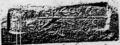
Σαμαρία (Fink. 210)