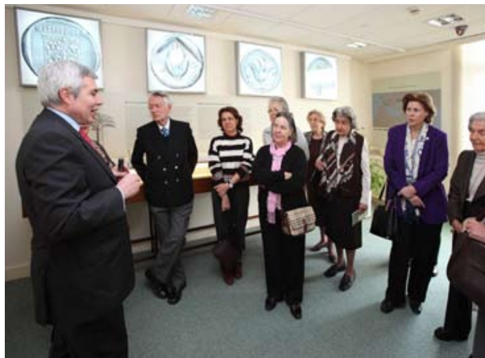
The Philoi at the ALPHA Bank Numismatic collection.

In March the Philoi visited the archaeological sites of Olympia, Ancient Messene, and the Temple of Apollo Epikourios as