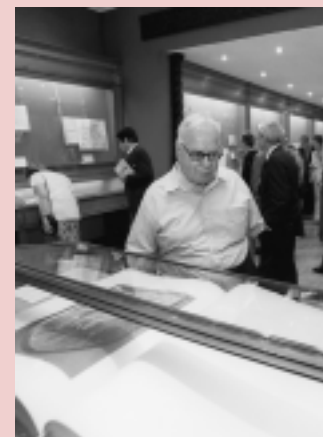
Photo, above-left: Director of the Library, Haris Kalligas, guides Minister of Culture Eleftherios Venizelos around the exhibition. Photo, above-right: A guest takes a few moments to admire one of the 75 treasures on display.