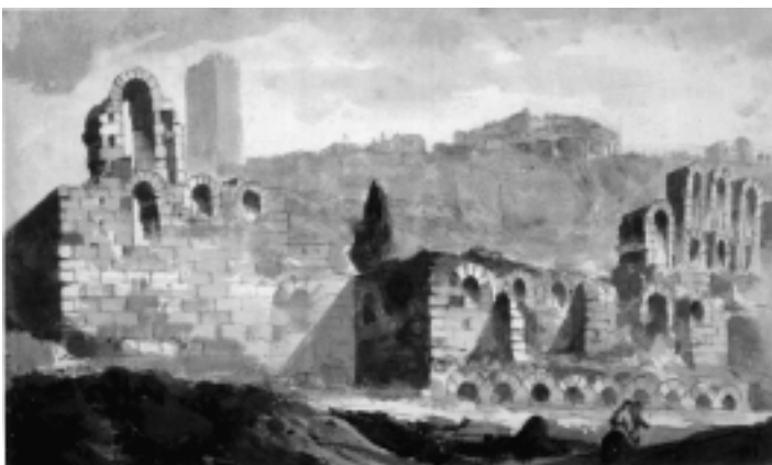
From Haygarth Catalogue of Sketches, "Odeum of Herodes Atticus or Theatre of Bacchus, according to Stuart."