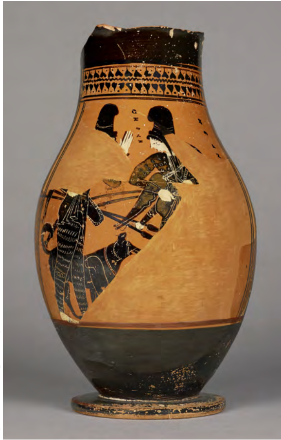
Figure 2 ( left ). Athenian black-figure olpe attributed to the Leagros Group, showing two Amazons with a dog, 525–510 B.C. Malibu, J. Paul Getty Museum, Villa Collection 86.AE.130.