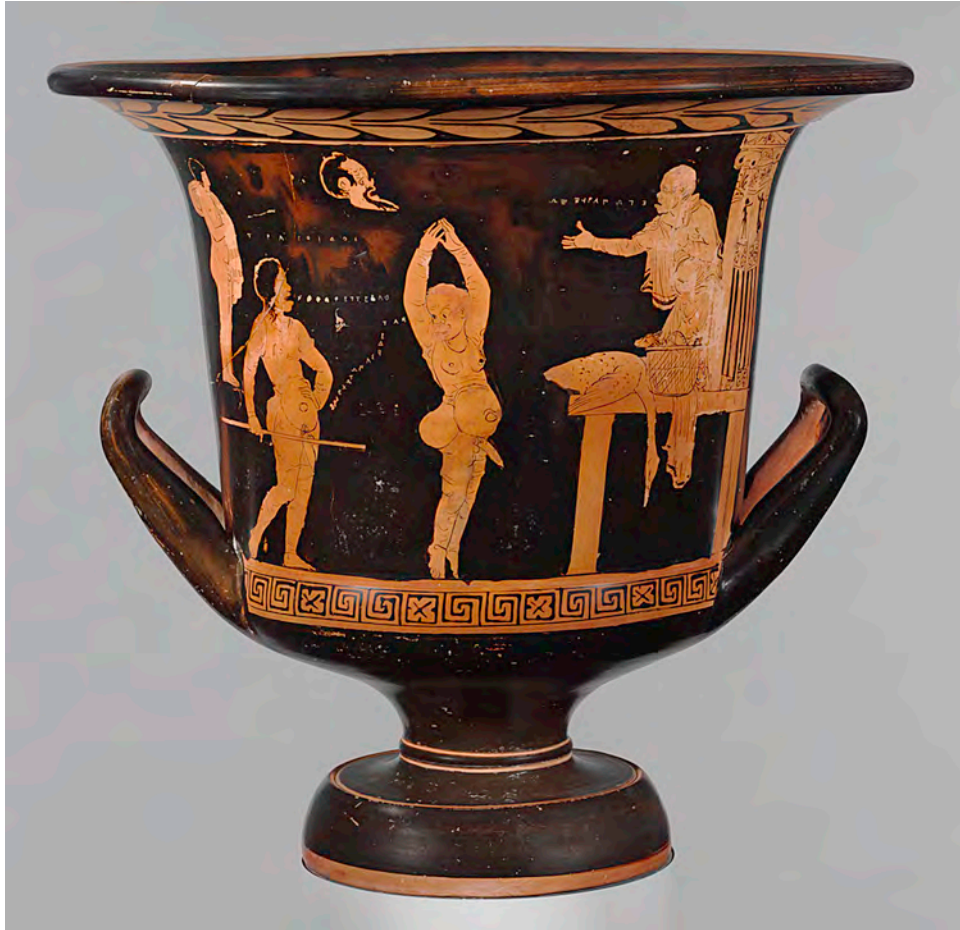
Figure 6. Apulian calyx krater attributed to the Tarporley Painter, known as the New York Goose Play Vase, ca. 400 B.C. New York, Metropolitan Museum of Art 24.97.104.

his hands above his head, about to be flogged by an authoritative young man in an “ugly” mask holding a stick, identified by scholars as one of the Scythian policemen of Athens. On the right, an old woman gestures toward them; beside her are a dead goose and two kids in a basket. It is generally assumed by scholars that the old man has stolen the objects on the right and that he is about to be punished by the policeman on the left. 89