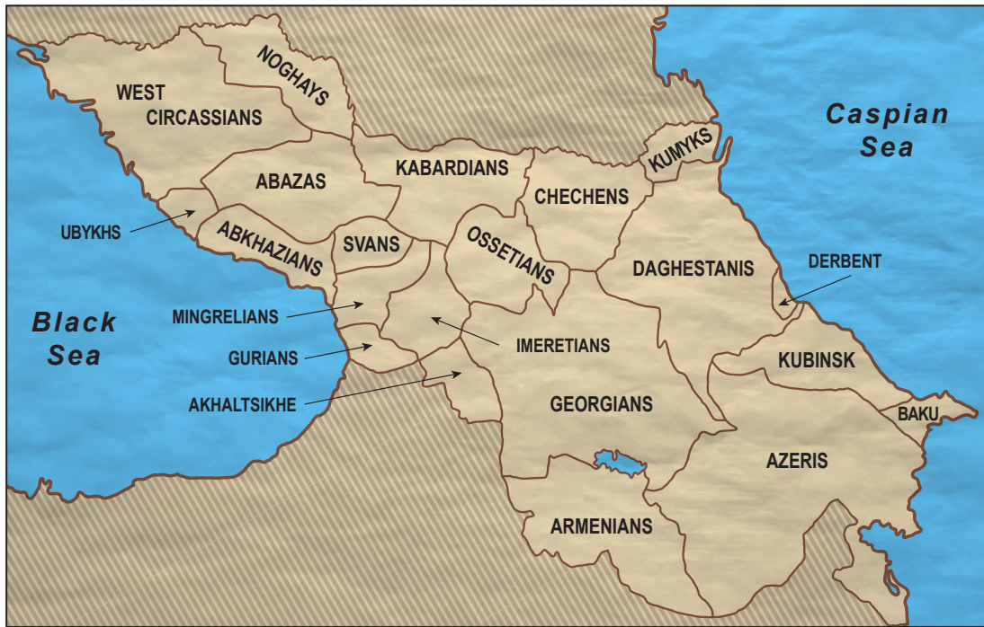
Figure 5. Map of Caucasian peoples and districts, end of the 18th century. M. Angel

© American School of Classical Studies at Athens This Open Access article is licensed as CC-BY-NC-ND Subscribe to Hesperia: http://bit.ly/1qz5LhF