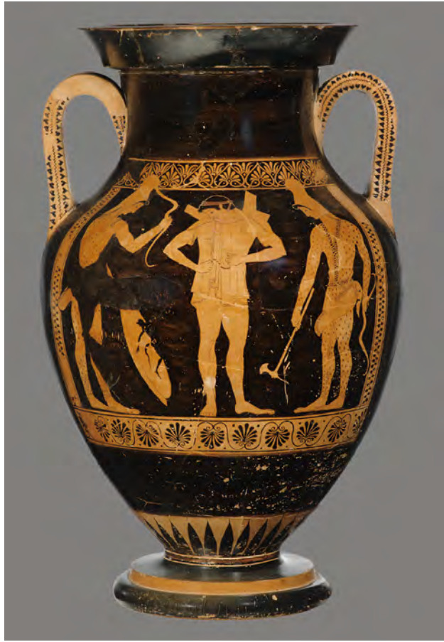
Figure 3 ( right ). Athenian red-figure amphora, type A, signed by Euthymides, showing a hoplite accompanied by two archers in Scythian costume, 510–500 B.C. Munich, Antikensammlungen 2308.

Nonsense inscriptions on vases have often been dismissed as the result of illiteracy or boredom, but a mixture of sense and nonsense on a single vase is a more complex matter. Immerwahr has written extensively about literacy on Greek vases. Among the explanations he suggests for unintelligible words are jokes, visual or acoustic illusions, meaningless decoration, copyists' misspellings, deliberate or careless imitations of actual writing, attempts to give an appearance of literacy, and outright illiteracy. 64 He also points out, however, that literate vase painters sometimes inscribed unknown words: his study published in 2010 lists vases that have a single misspelled name alongside clearly intelligible names. 65 As Immerwahr and others have remarked, in antiquity writing could have other purposes besides conveying meaning through words. Vase inscriptions, both sense and nonsense, were addressed to an audience; the words were not only read and sounded out, but they stimulated discussion among the viewers, in addition to serving as another element in the decoration of the vessel. 66