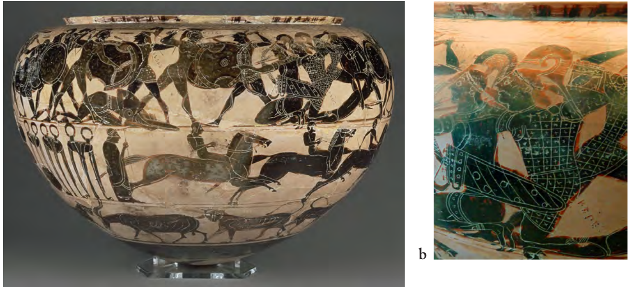
Figure 12. (a) Athenian black-figure dinos attributed to the Tyrrhenian Group, showing an Amazonomachy, 550 B.C. Paris, Musée du Louvre E 875; (b) detail of Kepes.