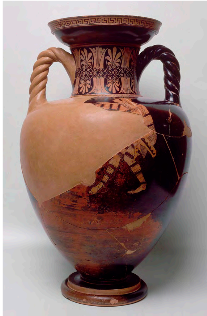
Figure 10. Athenian red-figure neck amphora in the manner of Euphronios, showing an Amazon shooting an arrow, 510–500 B.C. Paris, Musée du Louvre G 107.

/warq/ or /wark/ (*k/ → Circassian /q/) or even /varq/ or /vark/, but not /bark/, because this would have remained /b/ in Circassian. If the Greek name is derived from the same borrowed form, we need a form in the source language that gives initial Greek /b/ but Circassian /w/. The most likely candidate is */vark-/. Speaking roughly, this looks Iranian, especially eastern or even Indo-Aryan, since in these parts Indo-Iranian */w/ → /v/ (cf. Veda ← PIE * woid- , “knowledge,” Greek oida , “know,” English wit ). If it were Iranian, however, one would expect * var(a)g- with voicing of the suffix. Such a form would have yielded Greek * Bargida and Circassian */warγ-/. We prefer to take */vark-/ as an Indo-Aryan form, perhaps from the Sindians of the northwestern Caucasus, mentioned by Herodotus and Thucydides. 108 It would be an adjectival form from an earlier * war-ak(a)- . The root * var- itself would be from PIE * wel- , as in Tocharian walo , “king, ruler,” and English weal(th) . We would still take the element /-ida/ as a kinship suffix cognate with that in Greek. On this interpretation, Barkida appears to mean “Princess” or “Noble Kinswoman.”