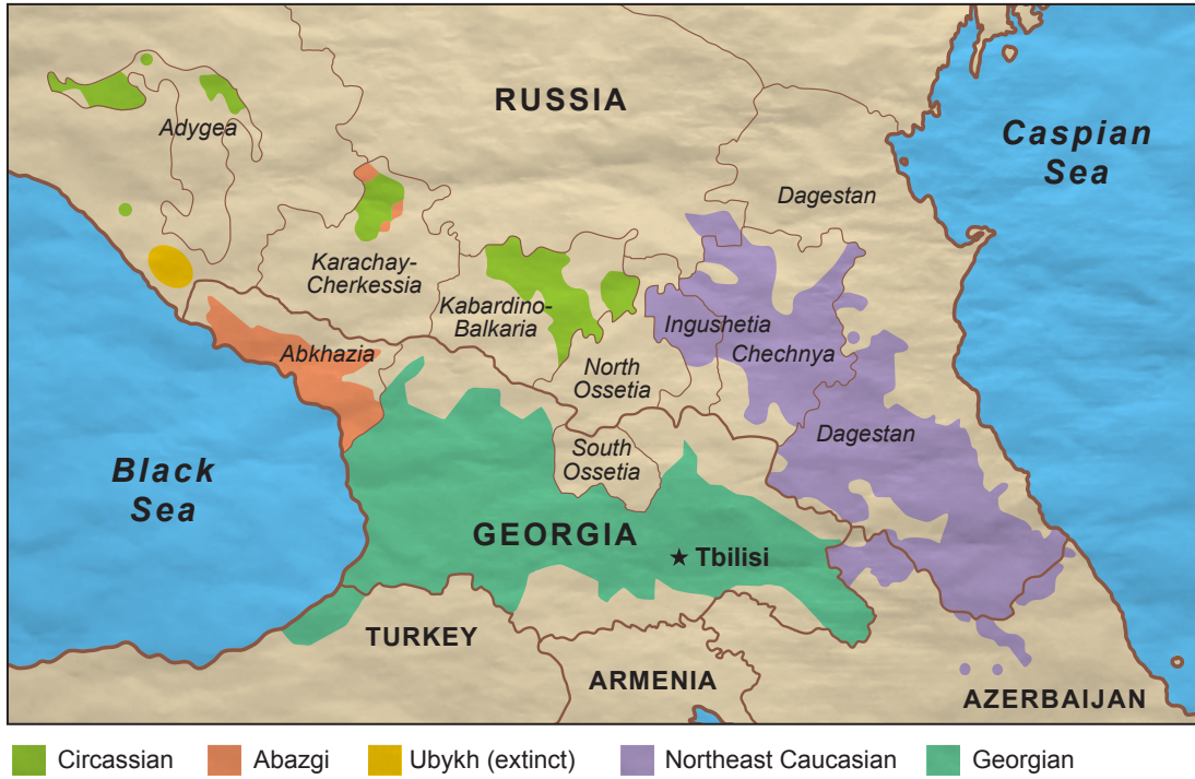
Figure 4. Simplified map of North Caucasian language groups spoken today. M. Angel