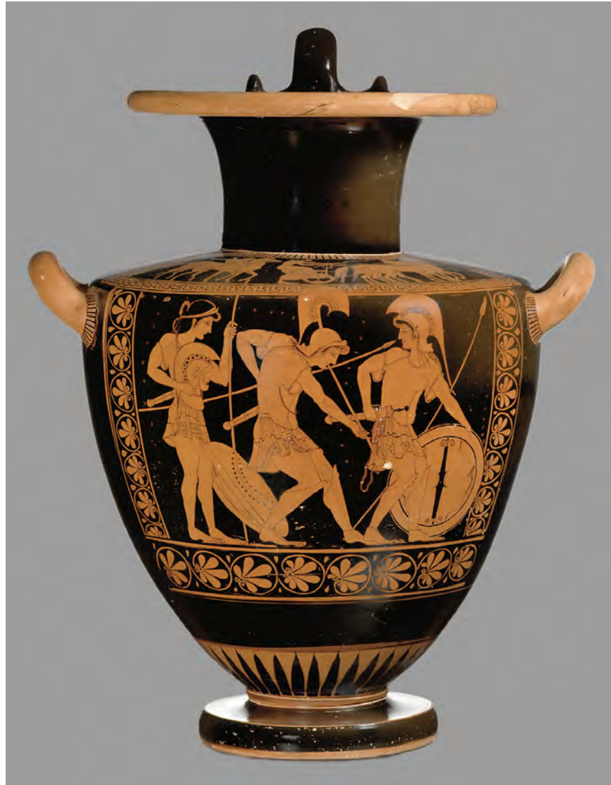
Figure 8. Athenian red-figure hydria, signed by Hypsis, showing three Amazons preparing for battle, 510–500 B.C. Munich, Antikensammlungen 2423.