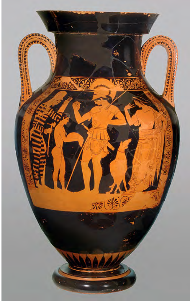
Figure 13. Athenian red-figure amphora, type A, attributed to the Kleophrades Painter, showing a warrior with a Scythian archer, a boy, a dog, and a woman, ca. 510–500 B.C. Würzburg, Martin von Wagner Museum L507.