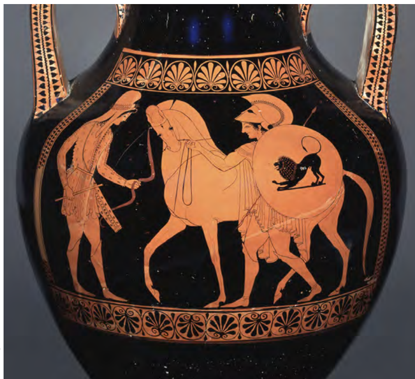
Figure 9. Athenian red-figure amphora, type A, recalling the Euergides Painter, showing a warrior with a horse and an Amazon or a Scythian, 525–500 B.C. London, British Museum E253.

on the part of the vase painter to capture a retraction of the tongue, and this would indicate a voiced uvular fricative (perhaps still a voiced uvular stop in antiquity, */G/) rendered by the Greek gamma. Some dialects and speakers of Circassian place a stress on the present participle ending /-we/, while others would place it in such a construction before the root, i.e., on the <a>. The original might have had the more usual preverbal root stress of Circassian and so presented a phonetic [a] as the second vowel of this form, reflected by the <a> in the Greek inscription. It is possible that the vase painter was trying to capture a rounded voiced velar stop, /gʷ/; if so, the name would be /sə-rə-gʷ-wə/, sword/dagger-instrumental-stuff/cram, “jab into someone”(?), although in that case one would expect the preceding vowel to be an <o>. The semantics favor the first possibility.