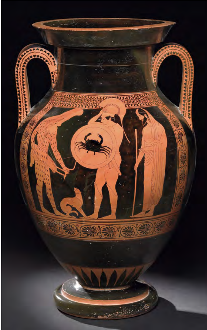
Figure 14. Athenian red-figure amphora, type A, attributed to the Dikaios Painter, showing a warrior with a Scythian archer, a dog, and an old man, ca. 510–500 B.C. London, British Museum E255.

reference to the archer, whose name, Gekhgogkh, means “Brave Adversary” in Abkhazian. The label for the hoplite, Khekhgiokhekhoge, translates as “One Chosen from among the Brave” in Circassian, an appropriate description of a warrior. The old man’s name, Kleiopkhio, seems to identify him in Circassian as the descendant of “the daughter of a big man.” The incomplete word inscribed above the dog is unclear; perhaps it is the dog’s name. 129