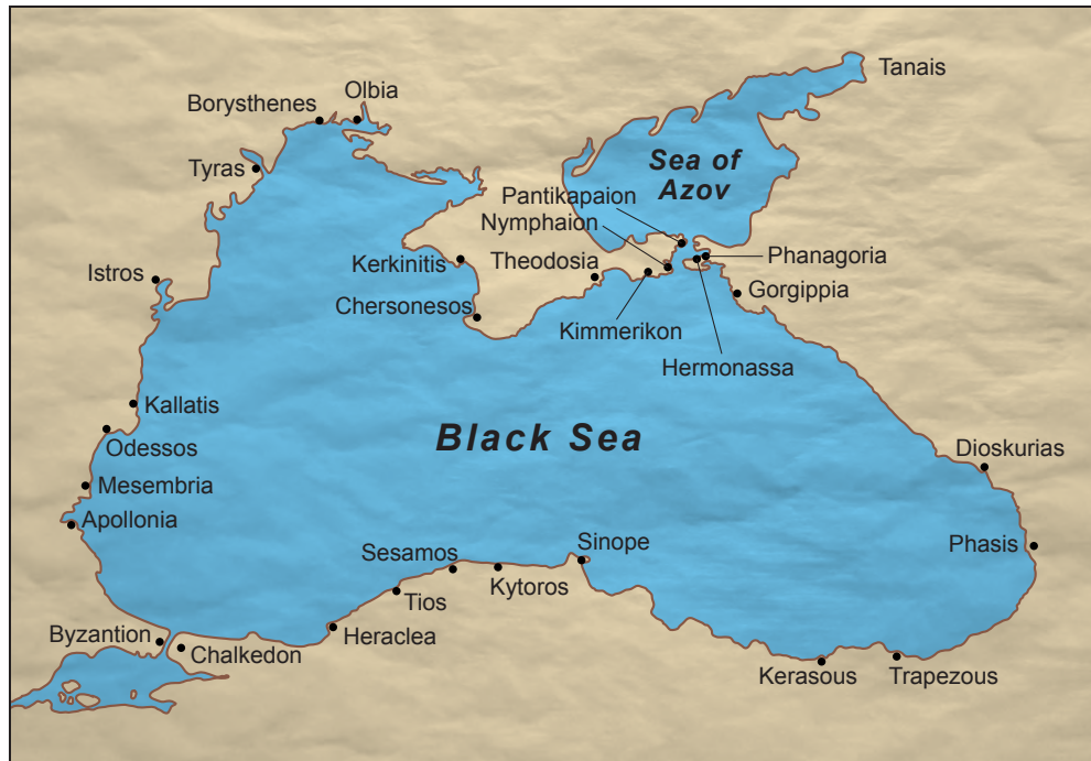
Figure 1. Map of Greek colonies around the Black Sea, ca. 550 B.C. M. Angel

22. On sources of slaves in Athens, see Braund and Tsatskhelidze 1989; Tsatskhelidze 2008; Braund 2011.