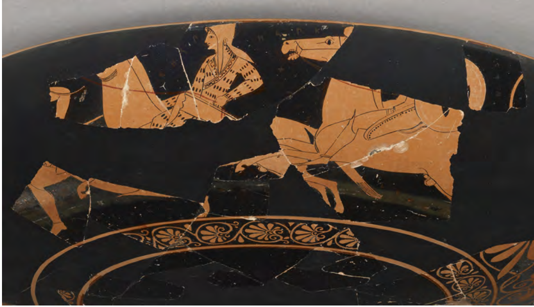
Figure 7. Athenian red-figure cup attributed to Oltos, showing Amazons running and on horseback, 525–500 B.C. Malibu, J. Paul Getty Museum, Villa Collection 79.AE.16.