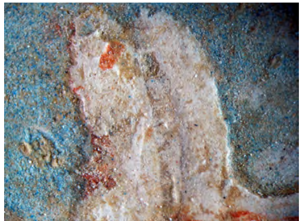
Figure S5 ( top, left ). Detail of sleeve showing worn area where the superimposition of the layer of Egyptian blue is visible. Photomicrograph 6.3 \times . H. Brecoulaki