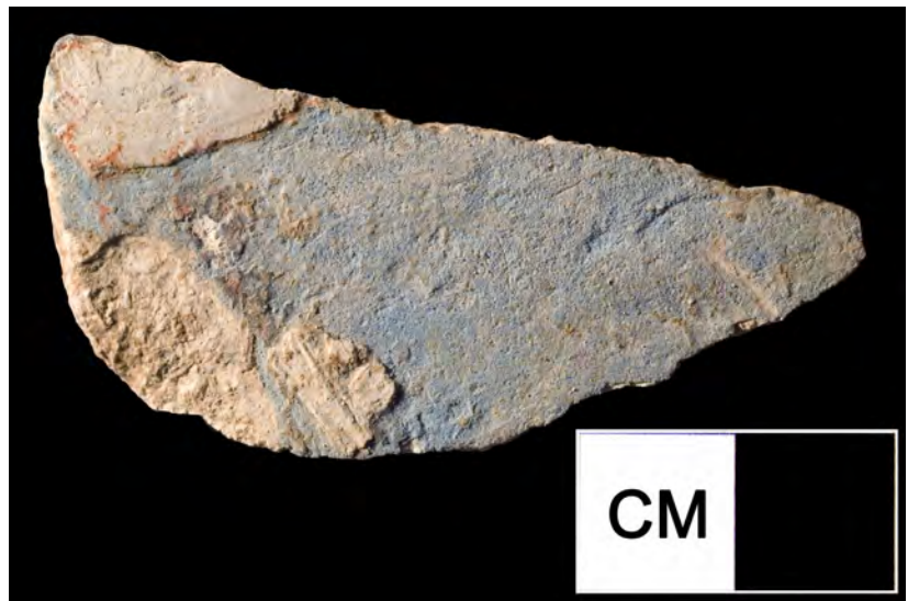
Figure S2. Small joining piece 063.71. Photo in raking light. J. Stephens