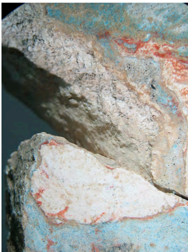
Figure S4. Detail of probable left hand with fingers depicted in red paint, and worn area where layer of gray paint (grains of carbon black) is visible under the layer of Egyptian blue. Photomicrograph 6.3x.