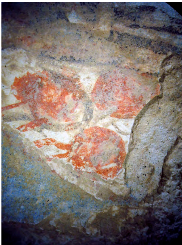
Figure S3. Detail of red spherical motifs on probable right arm.