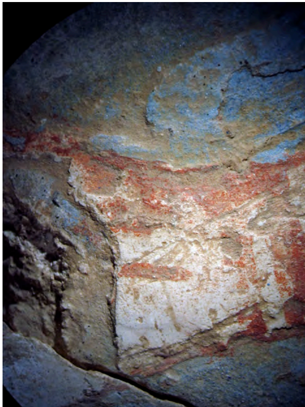
Figure S10. Detail of probable left hand and wrist. Photomicrograph 6.3x. H. Breoulaki