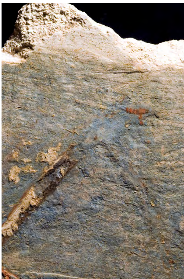
Figure S11. Detail of upper part of bow and islets of white paint. Photo in raking light. J. Stephens