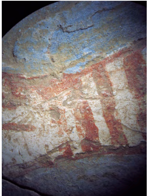
Figure S9 ( bottom ). Detail of red stripes on wrist of probable left arm. Photomicrograph 6.3 \times . H. Brecoulaki