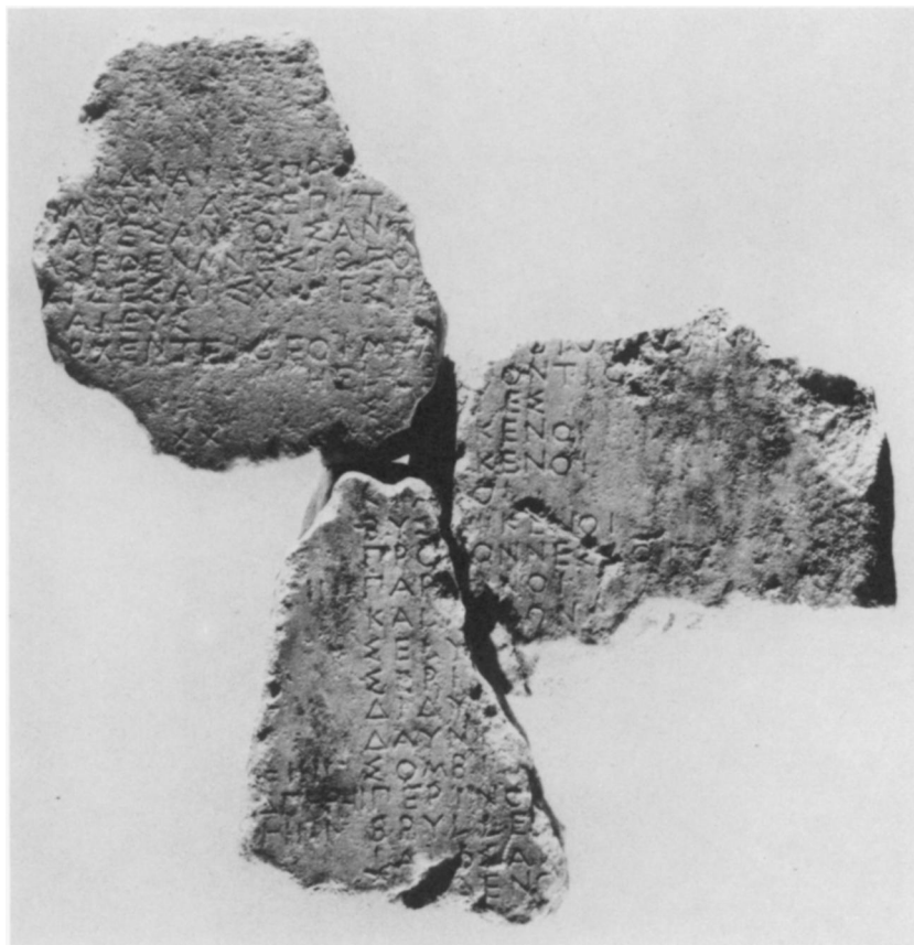
b. Agora I 7397 (Fragment 5) in place in List 37, joining Fragments 1 and 3