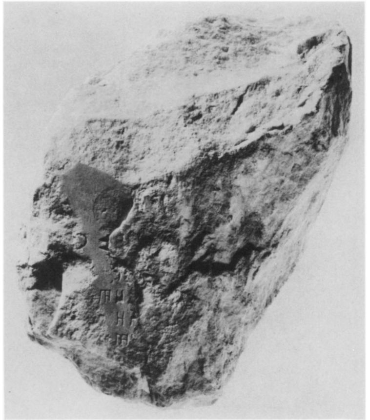
c. Agora I 7377 from List 15