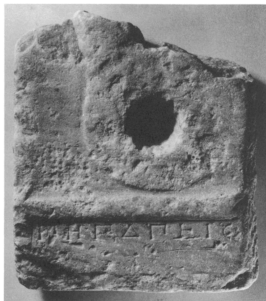
No. 4 I 4940

DONALD W. BRADEEN: NEW FRAGMENTS OF CASUALTY LISTS