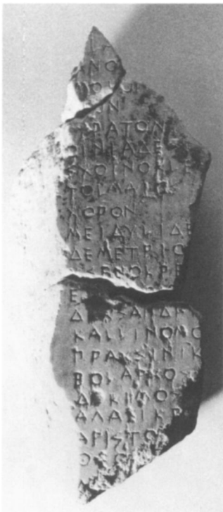
No. 2 I 953 d + f + c

DONALD W. BRADEEN: NEW FRAGMENTS OF CASUALTY LISTS