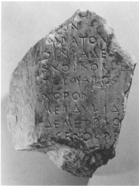
No. 2 I 953 f